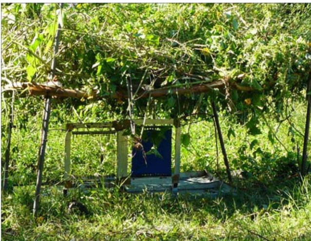
Figure 3. A small target underneath a 0.5 m high leafy canopy to investigate the effect of overhanging vegetation. doi:10.1371/journal.pntd.0001336.g003

Vegetation encroachment around a small target, from the sides and above, does not significantly affect its killing efficiency for G. f. fuscipes as long as there are some openings between adjacent bushes, wider than 30 cm. These results are intriguing because the rapid re-growth potential of the tropical vegetation in the habitat of G. f. fuscipes and other Palpalis group tsetse, combined with the small size of the targets, could make it seem improbable that these targets will remain effective. Indeed, our results show that only one such scenario, grass regrowth very close to the target, poses a serious threat to their performance. Our simulation of grass height corresponds roughly to between c. 15 (15 cm high) and 60 days (60 cm high) as observed in the rainy season in the field. As expected, the small diameter clearings (0.75 m) created by the