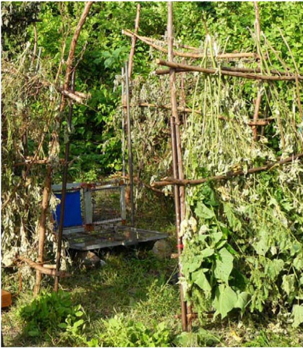
Figure 2. A small target closely surrounded by 15 cm hedges to investigate the effect of thick grass regrowth. doi:10.1371/journal.pntd.0001336.g002

(9.9 flies/day, s.e.d. = 0.08) caught 80% ( P < 0.001 ) more females than the target with one drum in front (Treatment A, 2.0 flies/day) and 98% more females than with a drum on each side (Treatment B, 0.03 flies/day). Catches of male G. f. fuscipes showed no significant difference ( P = 0.2 ) between the target in the open and either of the treatments, although 20% less flies were caught with one drum in front of the target (Treatment A, 3.2 flies/day) and 80% less with a drum on each side of the target (Treatment B, 0.2 flies/day), completely obscuring the frontal views. When placing a target next a real tree trunk (Table 1, exp. 9) there was a doubling in female catches with both the blue cloth closest to