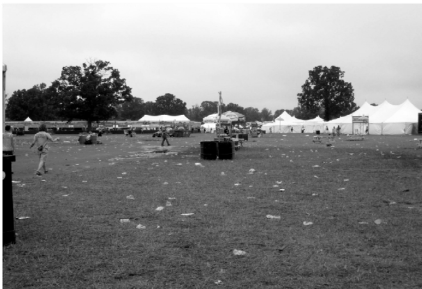
Figure 5 - Litter and environmental damage in the main festival areas

In addition, after having many conversations with the festival attendee population, the researcher discovered that while many of them know the obvious ‘greening’ activities taking place on-site (i.e. recycling et.), they are unaware about the extent to which Bonnaroo goes to carry out its ‘greening’ policies and maintain a sustainable festival, despite considering it to be a green or sustainable festival, showing the power of these hyperreal spaces and activities to dominate perceptions of the event.