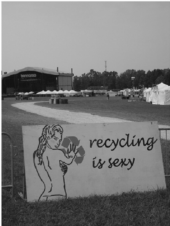
Figure 2 - sustainability signage

Brooks (2007) and Laing & Frost (2010) have noted the importance of properly engaging event stakeholders in order for an event to succeed in its sustainable efforts. From the research gathered in this study, the impacts of all volunteers on Bonnaroo's 'greening' policies are significant in certain areas (i.e. waste diversion) but the inconsistencies between the policies and practices that Bonnaroo promote and the actual behavior and knowledge of volunteers and attendees lead to legitimate questions about the success of their sustainability efforts. The analysis of data collected in this research shows room for improvement by incorporating more 'greening' knowledge into the volunteer training process, to give them the tools to better educate and inspire festival goers, which will ultimately increase the overall success of their 'greening' practices. With upwards of 70-80,000 people in attendance to a festival like Bonnaroo, the chances of a negative environmental impact are significant without proper training and 'greening' promotion. Through the ethnographic data collected, the researcher discovered that waste diversion was the only 'greening' programme that the large majority of festival goers were aware of and actively participated in. When asked about their knowledge of greening activity on site, the following responses were typical: