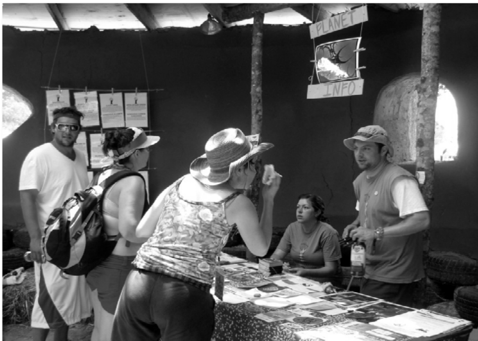
Figure 3 - Planet Roo information booth

Through the use of micro-ethnographic research methods the researchers discovered that the general volunteers were aware of the basics of the environmental outreach and promoted it within the festival but the key to ‘green’ promotion and success relied more heavily on the Planet Roo Ambassadors. These specialist volunteers, who had an environmental NGO or higher education backgrounds, worked both within the Planet Roo village and throughout the festival spreading both the message of the festivals ‘greening’ efforts and how they could contribute to the success of a more sustainable Bonnaroo while also educating event attendees on various environmental issues. The Planet Roo Ambassadors engaged with