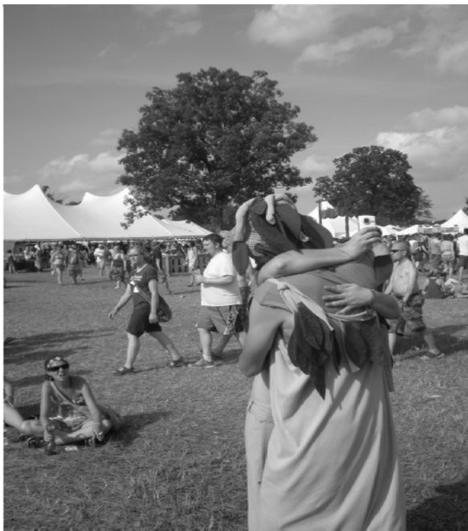
Figure 4 - Planet Roo Ambassador 'tree hugging' a festival attendee

We can consider these spaces and activities to be a manifestation of the hyperreal because they stand in place of less sustainable aspects of the festival, whose meaning is masked by the high-profile greening activities that take place on site. For example, in 2005 research found that attendees travelled from all 50 states of the USA and from 24 countries (Arik & Penn 2005). Our research found that the majority of attendees asked came using air and / or private cars as transport, agreeing with the 2005 study which found that 92% of attendees