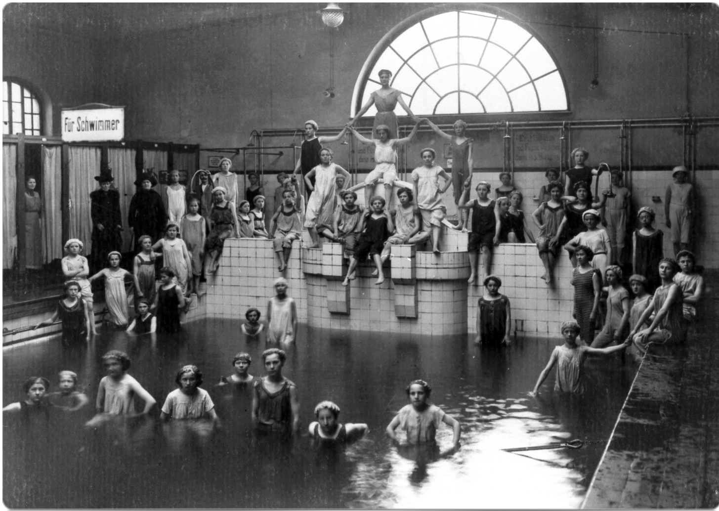
Swimming pool of the Röckling Steel Plant, c. 1910

The photograph therefore combines different aspects of the educational reform: it refers to rational technologies of body hygiene and at the same time reveals idealistic cultural patterns that are glorifying Ancient Greek and Roman times as crucial elements of educational thinking. In addition, hygiene-oriented education and its machinery seem to fit well into religious visions of purity and moral cleansing.