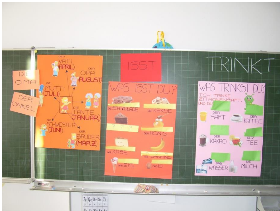
Image 2. Posters with family members, food and drinks.