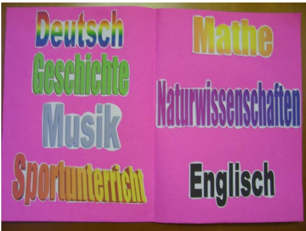
Image 6. Poster with school subjects.