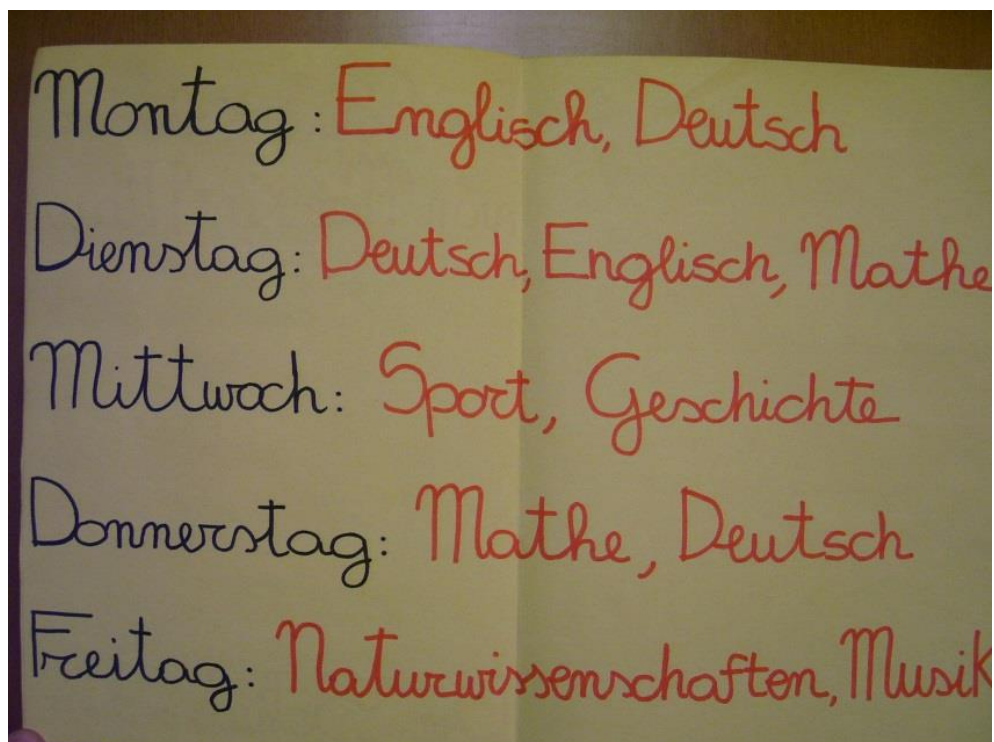
Image 7. Mickey Mouse's diary.