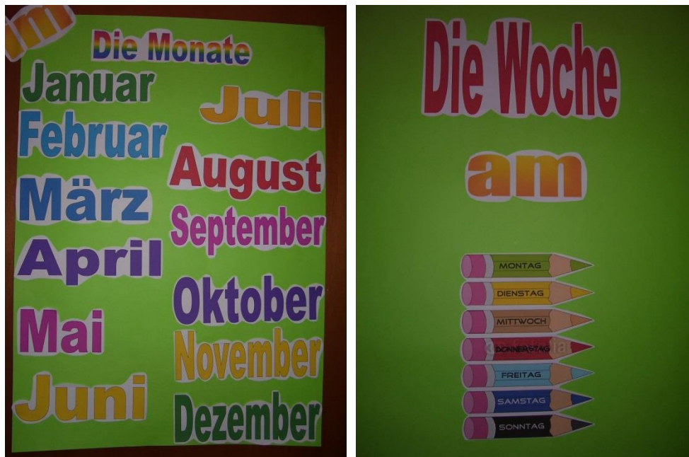
Image 3. Posters with months and days of the week.