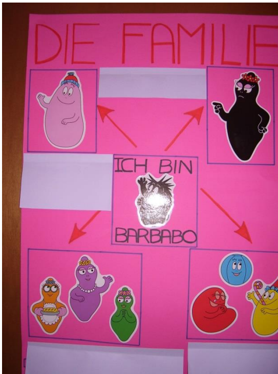
Image 5. Poster with family members.