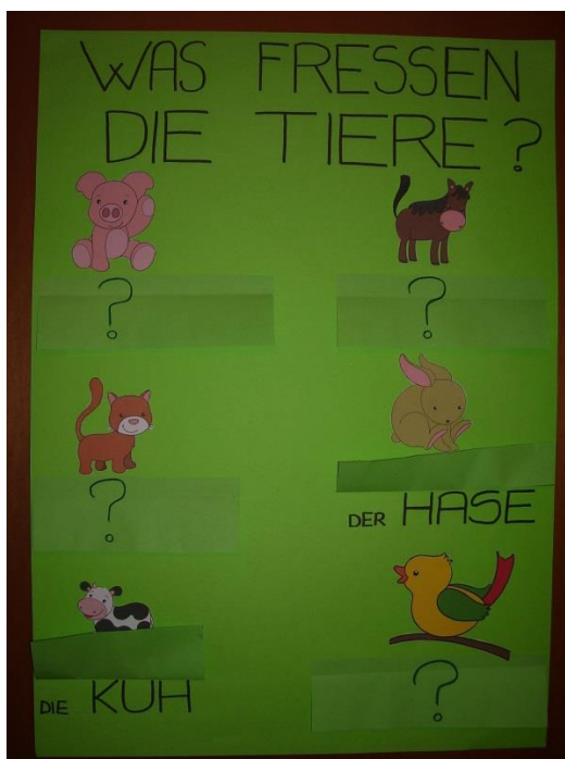
Image 4. Poster with animals.