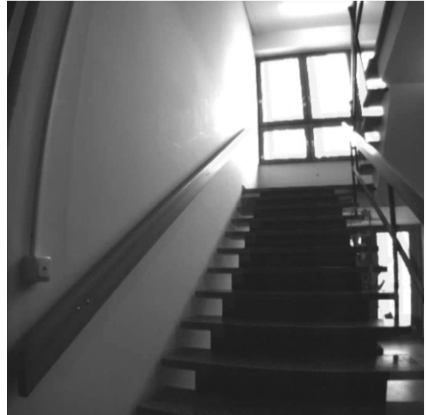
Figure 3: Image seen by one camera in an indoor test setup. Lighting conditions are difficult, regions without any texture occur.

Standard test field is an indoor scenario, in which a human operator carries IPS through a building performing a closed loop walk. This setup was used since it is a kind of worst case – lighting conditions change, texture is missing or self-similar, motion model is almost unpredictable. IPS reaches an accuracy of 2m/\sqrt{hr} meaning that a walk of one hour will result in an positioning error of 2m. For planetary exploration, IPS has to be mounted on a suitable platform (rover, crawler) and tests have to be applied in an appropriate test bed. Fig. 3 and 4 illustrate the 3D capability of IPS.