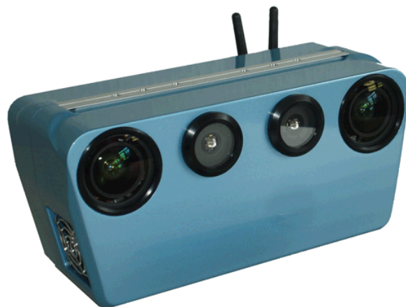
Figure 1: IPS sensor head, stereo cameras (left and right) and the lighting system (middle) can be seen. Dimensions: about 30 x 15 x 10 cm 3 , Weight: about 4kg, depending on configuration

Hardware. Main sensors are a stereo camera system and an inertial measurement unit. Other sensors providing information about position and/ or attitude and/ or their derivations can be included. Synchronization of incoming data of the different sensors has to be ensured. Accurate calibration and registration of all sensors is an essential prerequisite. Lighting can be implemented to ensure ability to operate even under dark conditions (see Fig. 1).