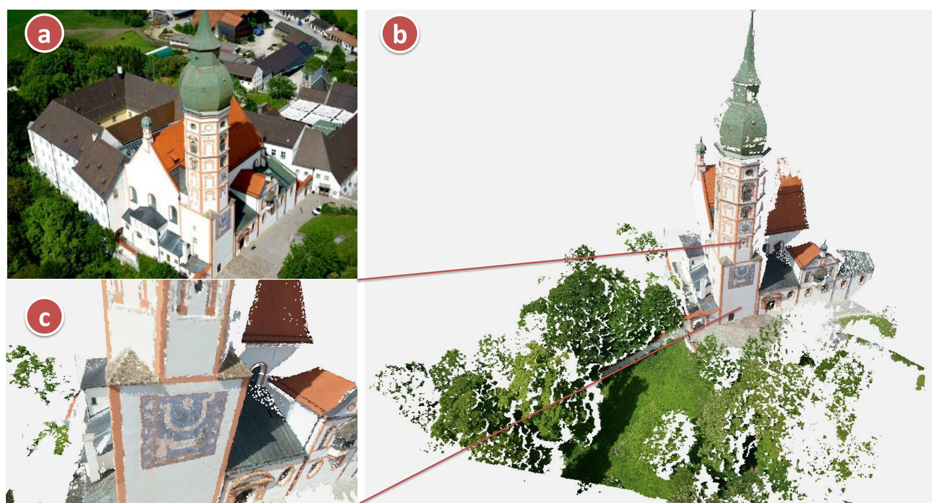
Figure 2: a) Flight over a chapel, b) corresponding voxel based 3D model, c) zoom on the wall pattern of the chapel.