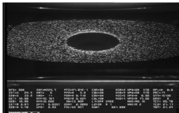
Fig. 5: Example of Plasma Kristall experiment video and telemetry downlinked from ISS to the ground

In Fig. 5 a typical view of the plasma Kristall experiment science video is showed.