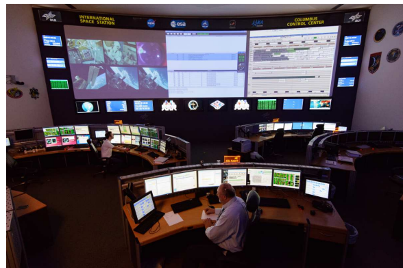
Fig. 3: Main Control room of the Col-CC during Increment 39

In [10] the development of the Col-FCT and GCT has been described and an outlook to the future has been given. The new operations concept which has been started in January 2014 is still in the transition phase. Fig. 3 shows the main Col-CC control room with the two remaining 24/7 FCT position Col-FD and STRATOS. The transition period is planned to be finalized by the end of 2014 when all ops products are up to date again and the workarounds implemented in beginning of the year can be retired.