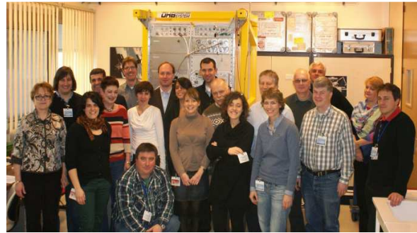
Fehler! Verweisquelle konnte nicht gefunden werden.: Team of Scientists and Flight Controllers supporting PK-4 experiment preparation at CADMOS OPS in February 2014.

In addition to the nominal OIP pre-coordination, some of the interface descriptions could be tested during the simulations. The coordination between COL-CC and CADMOS and the interface to MCC-H have been tested. Moreover, the simulation environment was used for evaluation of the PK-4 Operations Data file procedures for the experiment mechanical integration. Comments from the simulations and training have been incorporated into OPS products and OIP before starting the formal review.