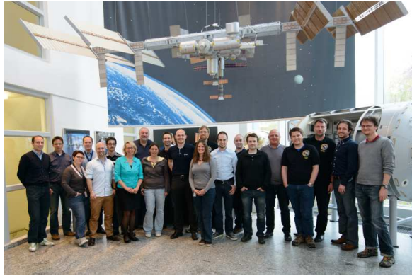
Fig. 1: Alexander Gerst and the Col-CC Team during his stay at Oberpfaffenhofen

Col-CC in 2013 and 2014, respectively. During this pre-launch tag-up the upcoming increment was discussed and the cooperation between Columbus control center and the astronaut during his stay at the ISS was agreed (see Fig. 1).