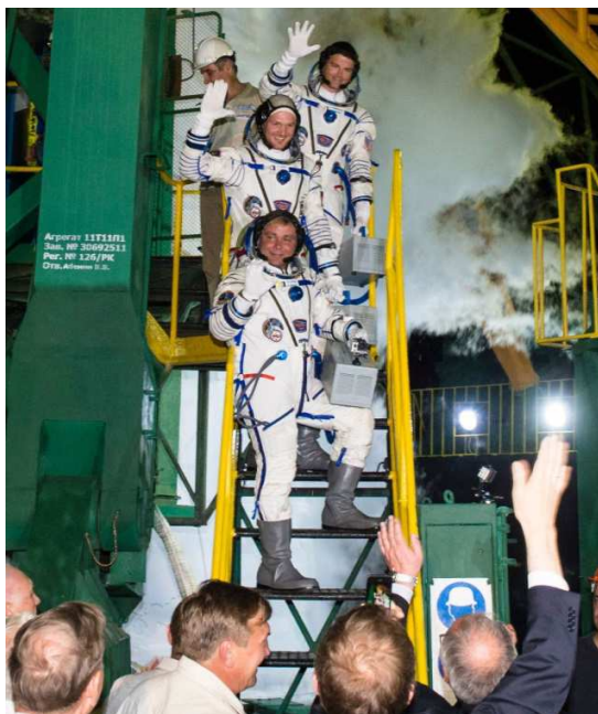
Fig. 2: Alexander Gerst, Maxim Suraev and Reid Wiseman prior to boarding the Soyuz TMA-13M

The launch of Soyuz on 28 May was picture-perfect and with the new transfer approach the crew reached ISS already 6 hours later (see Fig. 2). ATV-5 – the last ATV – launched two months later to ISS delivers a lot of new experiments providing a lot of work for Alexander Gerst and the Columbus Flight Control Team.