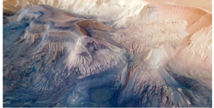
Fig.2: Depositional and erosional features in Hebes Chasma, HRSC stereo false color composite.

Earth as key reference, thus, studying terrestrial analogues is mandatory in planetary geology. Field work in Antarctica, Svalbard and Iceland [27,30,36,37] using similar instrumentation as on Mars provided a basis for the analyses of periglacial and volcanic processes, respectively.