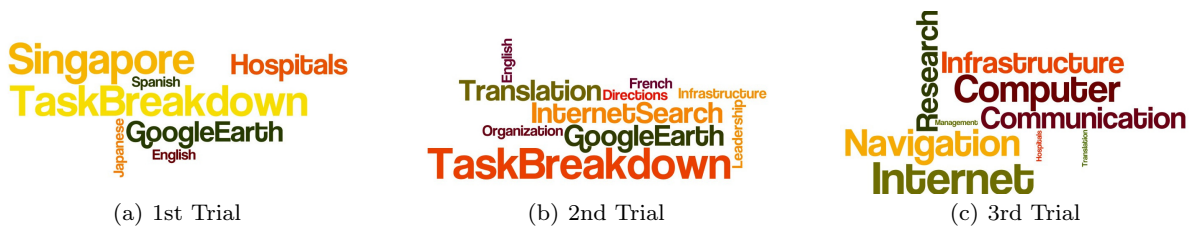
Fig. 4 Expertise tag clouds of user profile (Larger font size implies higher frequency, and vice versa)

sub-requests. Although an off-site leader was assigned in the 3rd trial, user feedback shows that he/she was not active enough in terms of leading the “divide-and-conquer” process.