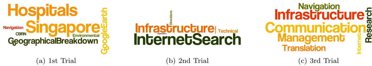
Fig. 3 Expertise tag clouds of requests (Larger font size implies higher frequency, and vice versa)