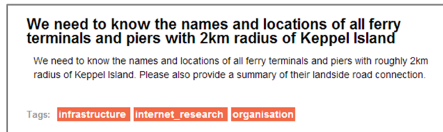
Fig. 2 An example of requests from on-site users

Due to the rapidly changing situation of the disaster site, the request from on-site users should be created spontaneously and may be diverse and require various expertise. To simulate such a situation, the disaster management expert continuously created requests during the trial process that might probably be raised by