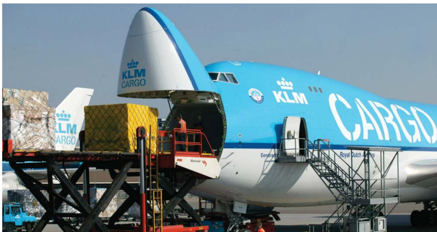
Photo 1: KLM Boeing 747-406F/ER/SCD being loaded

by: Florian M. Heinitz and Peter A. Meincke