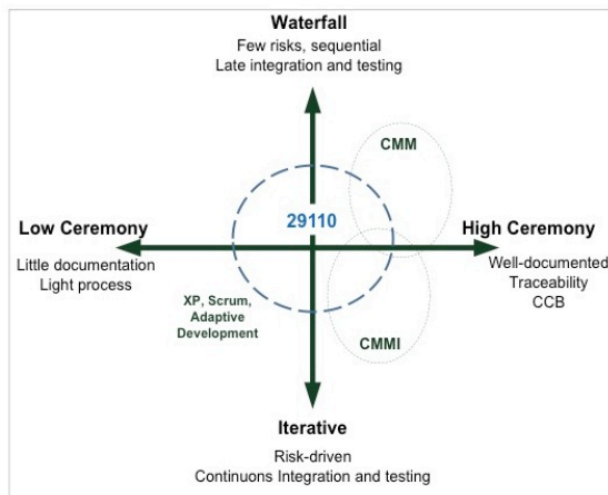
Figure 1: Positioning of the ISO/IEC 29110 (adapted from [Kro03])

axes. The horizontal axis (from left to right) illustrates the level of ceremony, from a low ceremony approach with little documentation (e.g. agile approach) to a high ceremony approach with a comprehensive documentation (e.g. plan driven CMMI approach). The vertical axes illustrate the approaches based on the level of risk. The top axis illustrates a low risk linear approach using a waterfall approach while the lower part of the axis illustrates a risk-driven project using an iterative approach. ISO/IEC 29110 is located at about the center of both axes.