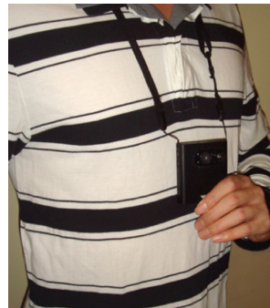
Fig. 1. SenseCam worn by a user

Once lifelogging hardware reached the stage of being useful for real world applications, the focus shifted towards mining deeper meanings from lifelogs i.e. eliciting their semantics. However, the state-of-the-art in enhancing lifelog events is almost all based on low-level feature matching. An everyday event enhancement technique with more comprehensive online resources is introduced in [8], in which SenseCam images are augmented with images from external publicly-available data sources such as Flickr, YouTube, etc. The shortcomings of this are obvious in that the task is performed based on image matching using