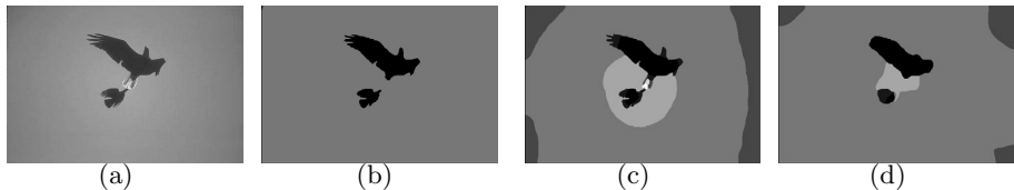
Fig. 1. (a) shows the given image. (b) shows the image partition result of (3) computed by the proposed method in this paper. It gives only two segments left along with properly smoothed boundaries! (c)-(d) show the partition results computed by the Potts model (5) without the label cost prior, which give the results either oversegmented (more labels) or oversmoothed. In this example we have used 11 evenly spaced labels.

(5) was actively studied during the last years, e.g. [7, 19, 2, 3, 27], and fast algorithms were developed at the same time, upon standard theories of convex optimization. It is well-known that the regularities of the partition boundaries, i.e. the second term of (3) helps to smooth out small-scale partitions, hence reduce the total number of 'appearances' implicitly. However, only considering such smoothness prior often fails to recover correct labeling results and often leads to either over-partition or over-smoothness (see Fig. 1). This is in contrast to the model (3) which explicitly couples the label cost prior. Its result possesses optimalities of both geometry and model simplicity. We show this by Fig. 1.