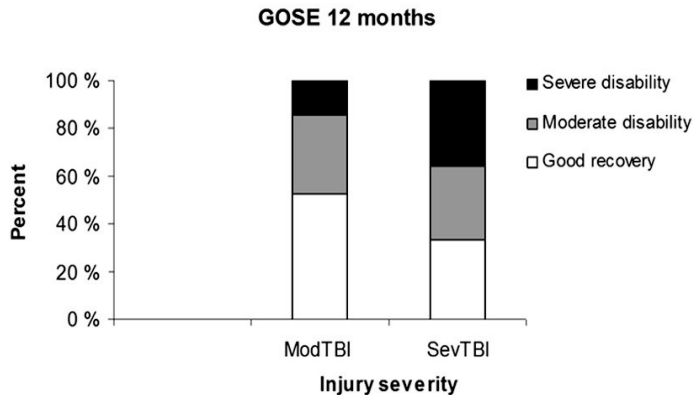
Figure 2. The distribution of GOSE outcome in moderate and severe TBI patients.

Functional global outcome for the whole group as assessed by GOSE at 12 months was “good recovery” in 40%, “moderate disability” in 32% and “severe disability” in 29%. The distribution of GOSE outcome in moderate and severe TBI is shown in Figure 2. As expected the outcome distribution was significantly shifted towards better recovery and less severe disability in the moderate TBI group ( P < 0.05 ). The outcome was “good recovery” in 11/21 (52%) with moderate TBI versus 14/42 (33%) in severe TBI, “moderate disability” in 7/21 (33%) with moderate TBI versus 13/42 (31%) in severe TBI, and “severe disability” in 3/21 (14%) with moderate TBI versus 15/42 (36%) in severe TBI.