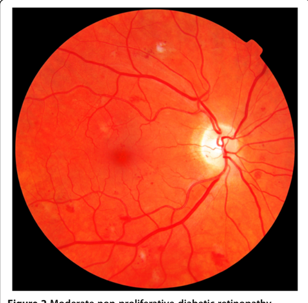
Figure 2 Moderate non-proliferative diabetic retinopathy.

The required sample size of participants was calculated based on the following: 50% prevalence of DR in the image sample, a standard deviation of true sensitivity and specificity for individual optometrists' image evaluation of 0.2, and 50% sensitivity and specificity for