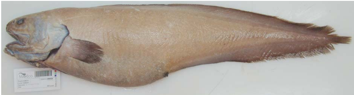
Spectrunculus sp. A (grandis) , among the dominating teleosts on the deeper stations.

Still, for a number of deepwater demersal fish species, juveniles tend to live at shallower depths than adults (Merrett et al. , 1991b; Paper 2). It has also been suggested that a “bigger-deeper” trend may be a sampling artefact specific to trawl gear (Merrett et al. , 1991b; Gordon and Bergstad, 1992).