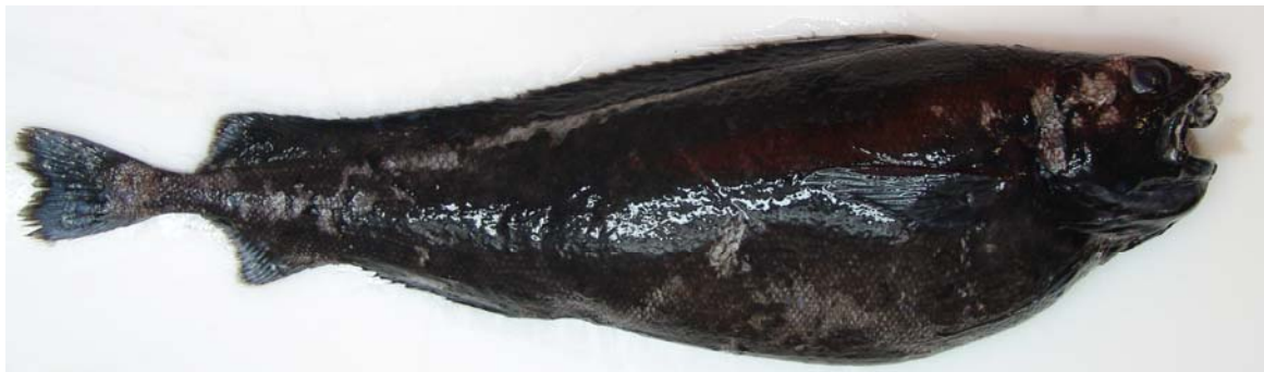
Blue hake, Antimora rostrata , frequently caught in both trawl and on longlines along the MAR.

Antimora rostrata , often referred to as blue hake, belongs to the gadiform family Moridae. The Genus Antimora currently comprises only two species with A. microlepis restricted to the North Pacific, and A. rostrata occurring in all other oceans from 62°S to 62°N (Small, 1981; Turnov, 1992). Previous records of occurrence are from 200 to 3000 m, but abundance seems generally to peak at depths >1400 m (Wenner & Musick, 1977; Gordon & Duncan, 1985a; Kulka et al. , 2003). A. rostrata was frequently caught in both trawl and longline catches, and particular focus was placed on this species due to data availability and a general lack of knowledge, especially from the gears and from the areas targeted in this study (see also Kulka et al. , 2003).