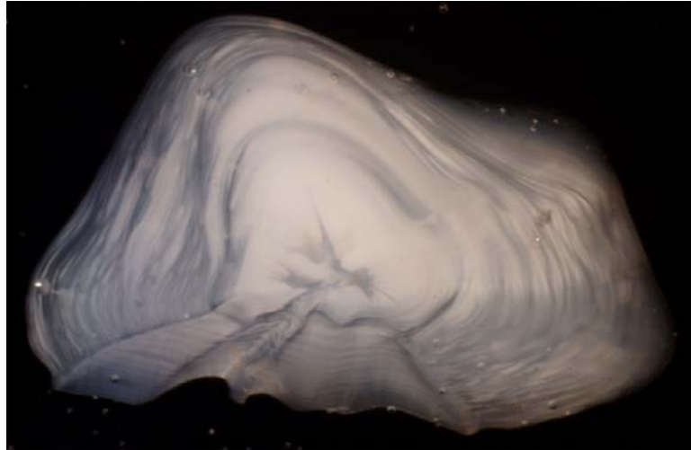
Image of a prepared slice of an A. rostrata otolith.