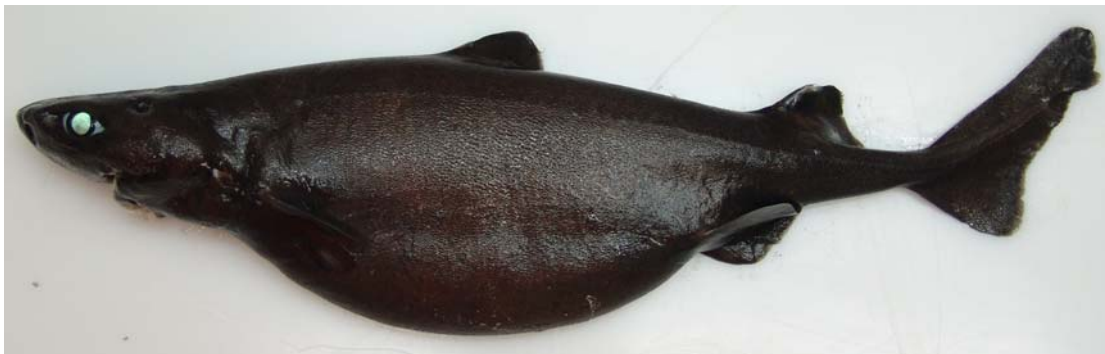
Female Etmopterus princeps , the overall dominating species in longline catches along the MAR.