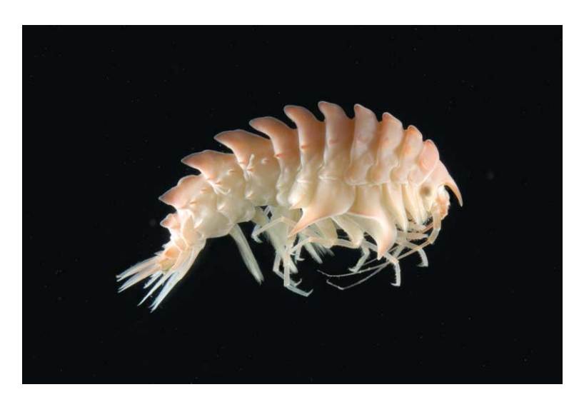
The amphipod Epimeria loricata (Sars, 1879) collected in the Barents Sea during an ecosystem cruise of the Institute of Marine Research (R/V Johan Hjort, September 2006)

The year 2007 has been proclaimed as International Polar Year, and this has stimulated increased research activities in both Arctic and Antarctic seas, which represent the most productive and least explored areas on our planet. Research of polar waters will always be an important topic to Marine Biology Research , as the journal is rooted in Scandinavia. Our major goal, however, remains to provide a high-profile communication forum for any globally relevant aspect of marine biology, whether basic or applied, bottom-up or top-down, syn- or autecology, descriptions of new species or large-scale systematic revisions, phenotypically or genetically based comparisons, small- or large-scale distribution patterns, or micro- or macro-evolution.