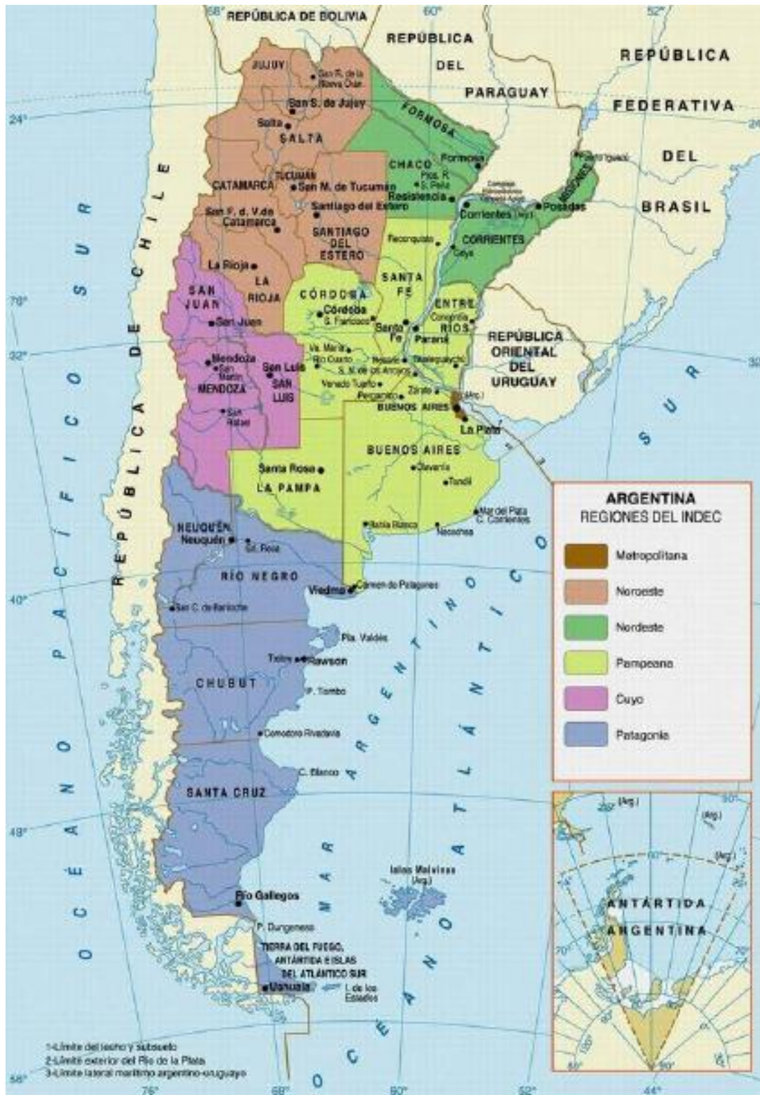
Attachment 1: Map of Argentina divided into regions.