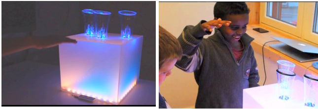
Figure 4. The water fountain project that uses LEAP motion to control the level of water. Photos from [38].

water fountain with LED lights, was fun to play with, had a pleasing, very soft sound of water and was nice to look at, see Fig. 4 and [38].