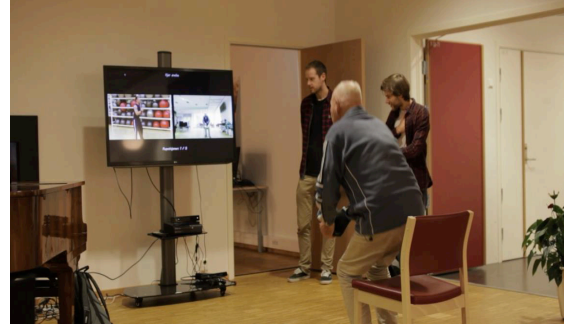
Figure 3: An exercise system that enables correction of movements during the exercise session. Photo from [33].

Even though these two groups have achieved very nice results, they were certainly not the only ones that pursued the goal to be innovative and creative. Different ways in which this focus on creative thinking and innovation affected the work of the project teams is discussed in the next section.