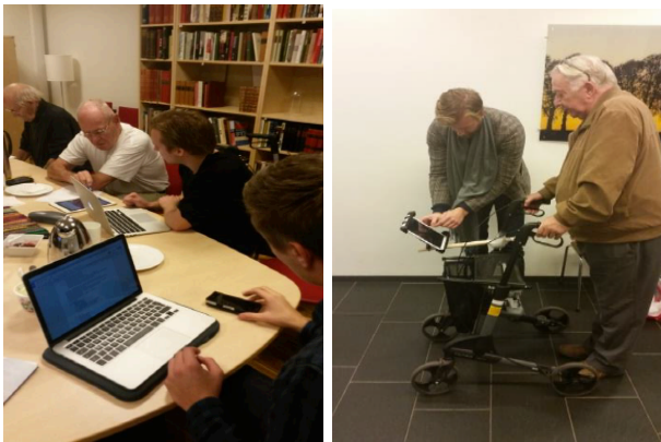
Figure 2. SmartWalker: design and testing. Photos from [34].

The two student teams consisted of four second year undergraduate students each, and were supervised by a PhD student whose research relates to elderly living in a smart house. Thus, both projects address design for and with elderly, see [33] and [34] (both projects were delivered in Norwegian, but one group also posted the abstract in English of the paper that they are writing for HCII 2015 conference [35]). The latter project, see Fig. 2, developed a high fidelity interactive prototype utilizing frequency based technology (iBeacons) that helps elderly with cognitive difficulties to navigate complex buildings indoor.