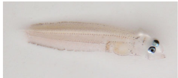
Fig. 2. Hippoglossus hippoglossus larva, 15 mm standard length, from Fauskevika, Skjerstadvjorden, North Norway.

All four halibut larvae were of similar developmental stage, and the standard length of one larva was estimated to 15 mm. All of the halibut larvae had food in their guts and had reached a developmental stage that corresponded to approximately two weeks after the establishment of exogenous feeding (Pittman et al. , 1987). The larvae were sparsely pigmented and had melanophores between the myomeres. In addition, dorso- and ventrolateral rows, and dorsal and ventral contour rows of melanophores were observed at the edge of the primordial fin, including a preanal ventral abdominal contour row of tiny melanophores. Two distinct areas of melanophores were observed above the brain (occipital and neck), and two other pigmented areas were seen at the angle of the lower jaw and in the heart region (Figure 2). The caudal tip of the notochord was just barely bent upwards. The observed larvae corresponded to the 13.5 mm Atlantic halibut larva first drawn by Schmidt (1904), and which was referred to as post-larva. Further, the collected halibut larvae from Skjerstadvjorden also matched stage 3 larvae as given by Thompson & Van Cleve (1936) for the closely related