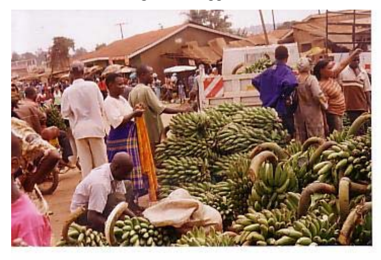
Photo 9 : Kasubi Market: Women and men busy trading in matooke (bananas)

Thus, when part of liberalization policy package is privatization of once state managed enterprises, retrenchment, wage cuts, and reduction of provision of social services, poor people and more especially women, suffer. Women suffer doubly because on one hand, they benefit less from publicly provided services, like education, health care; on the other hand, their work burden in the form of unpaid household work and care labour may increase. <sup>141</sup> In addition, as incomes in the households diminish, men abandon their families and women are left with the burden of taking care of the household members. Such changes brought about by liberalization; imply that the relative ease of entry in the informal sector makes it a refuge for all kinds of people who cannot get formal employment or with little capital or who generally cannot take advantage of the opportunities.