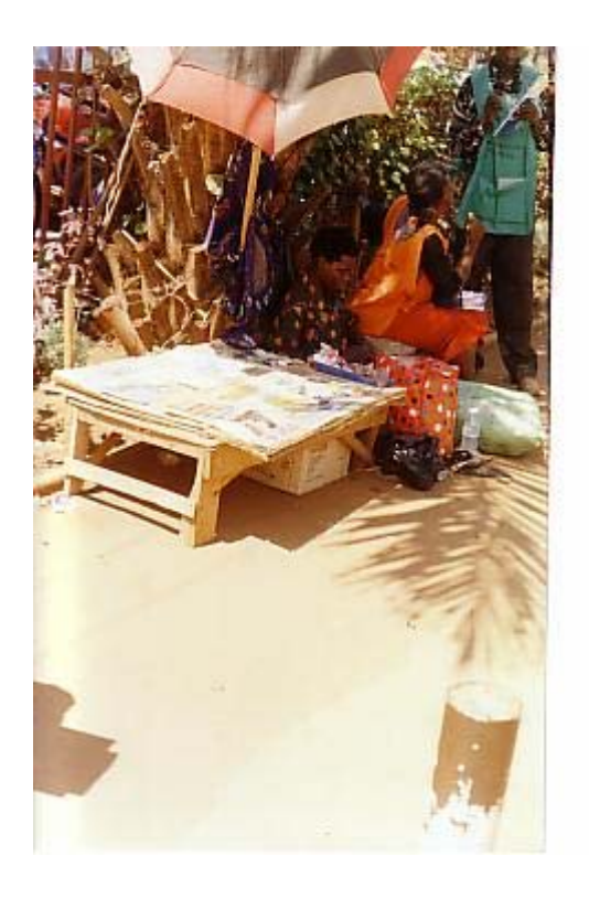
Photo 1 The photo above shows a woman street vendor in Kampala city selling Newspapers, and other

the periphery of the different economic sectors, especially in the informal sector partly because most jobs in the informal sector do not require high academic certification. In addition, given that there is no legal policy regulating these kinds of activities those engaged in the trade may be easily affected by new laws or changes that may be introduced by the city council. The fact that some of them sold/sell items that are prohibited by the city councils means that in case of confiscation, they lose their wares, may be forcibly removed from the streets. Thus, liberalization in Uganda has led to the expansion of informal sector but with women being more vulnerable to join the sector especially by participating in cheap trade activities whose profit margins only enable them to live from hand to mouth.