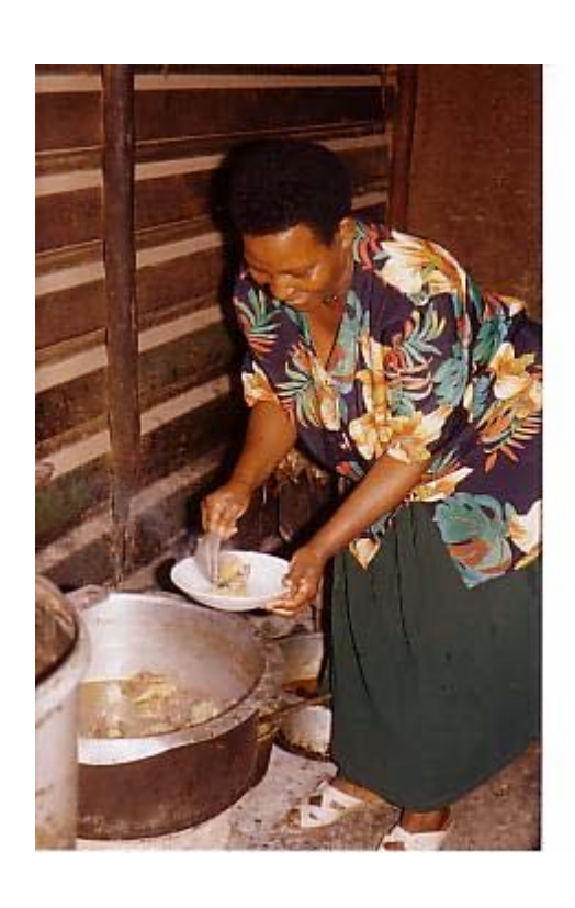
Photo 3 : Woman selling operating makeshift restaurant. She is getting food for a customer on the plate.