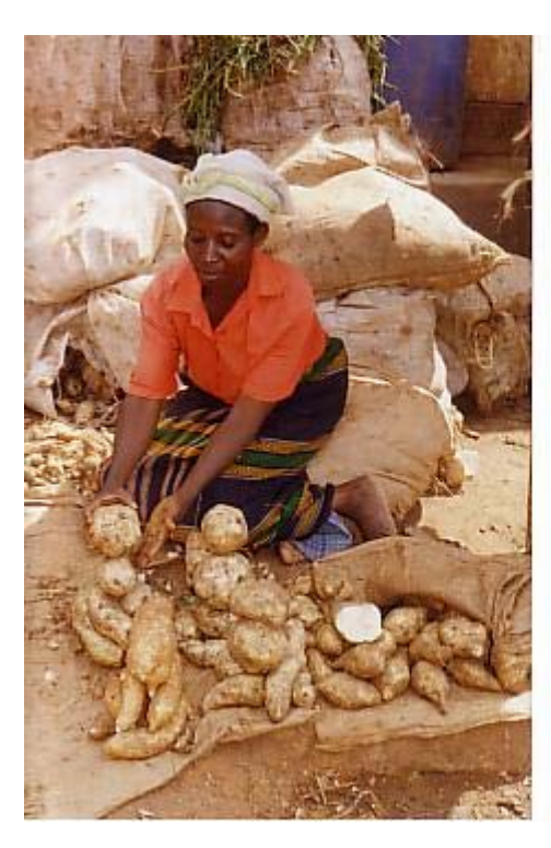
Photo 6 : Woman preparing sweet potatoes for sell in Kalerwe market