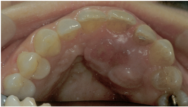
Figure 1 The clinical presentation of the tumour (in mirror).

showing crista neuralis-derived cells, were negative. Due to the possibility of a Kaposi's sarcoma, the patient was HIV tested with a negative result. CT scan showed destruction of the alveolar crest in the actual area, and a soft-tissue tumour approx. 2 cm in diameter (Figure 3). Skeletal scintigraphy showed increased Tc uptake in the actual area. A comprehensive treatment plan was lined up, including resection of the maxilla. As part of the preparations for tumour treatment, the patient delivered short time later two healthy twin boys by caesarean section.