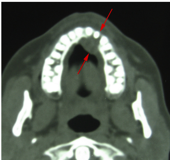
Figure 3 Axial CT scan of the maxilla showing the tumour and destruction of the alveolar process palatal to tooth 22 (Arrow).

formed. Sarcomas and other relatively rare malignancies are at the Dept. of pathology dealt with by a dedicated group of pathologists, and foreign experts are consulted in special cases, including this one. There are also regular organised discussion meetings between pathologists and surgeons for all malignant tumours to avoid mistakes based on misinterpretation of clinical versus histological data.