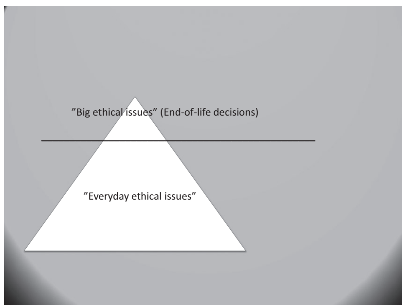
Figure 2 The ethics iceberg.

challenges and time to address these issues therefore seems to have a protective role for the psychological health of the staff. This underlines the necessity of regular ethics discussions in nursing homes.