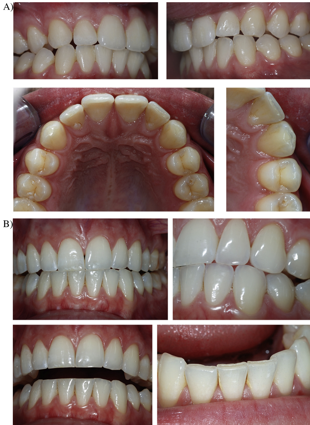
Fig. 1. Typical examples of individuals in the attrition group. (A) 21 year old man with marked attritional wear facets matching between opposing teeth in lateral excursion. (B) 26 year old woman with an almost perfect match between maxillary and mandibular incisors during protrusive movement. Note also the sharply demarcated wear facets extending into dentin on lower incisor teeth.