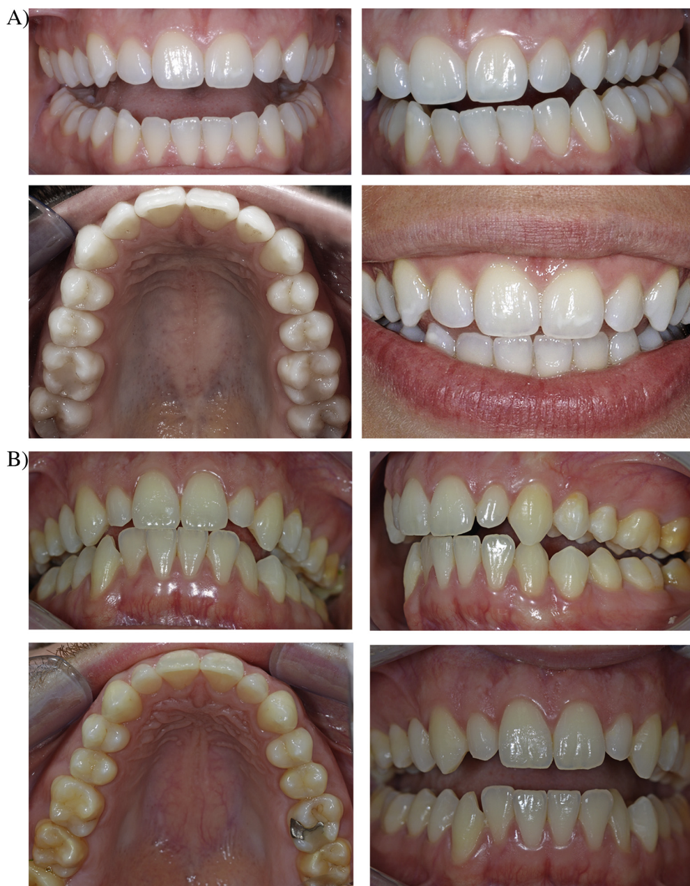
Fig. 2. Typical examples of individuals in the control group. (A) 24 year old woman with minimal degree of wear facets and non-matching anterior teeth in lateral excursion, canine guidance only. (B) 25 year old man with similar features.