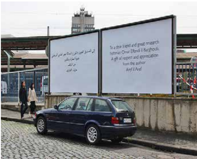
Emily Jacir , billboard installation