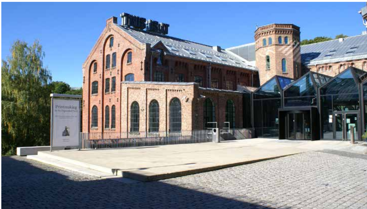
Oslo National Academy of the Arts september 2015

the problematic of the set criteria that modernism founded. The radical changes within the field of printmaking the last 20 years have totally changed the approach towards the media. Printmaking is now an art form that expands into sculpture, performance, clothes, installation, the commercial aspect, cyberspace, artist books, multiples, 3D prototyped objects/prints, ready-mades, newspapers etc. The result is a cross pollination which in its turn points to the total reflection of today's contemporary art.