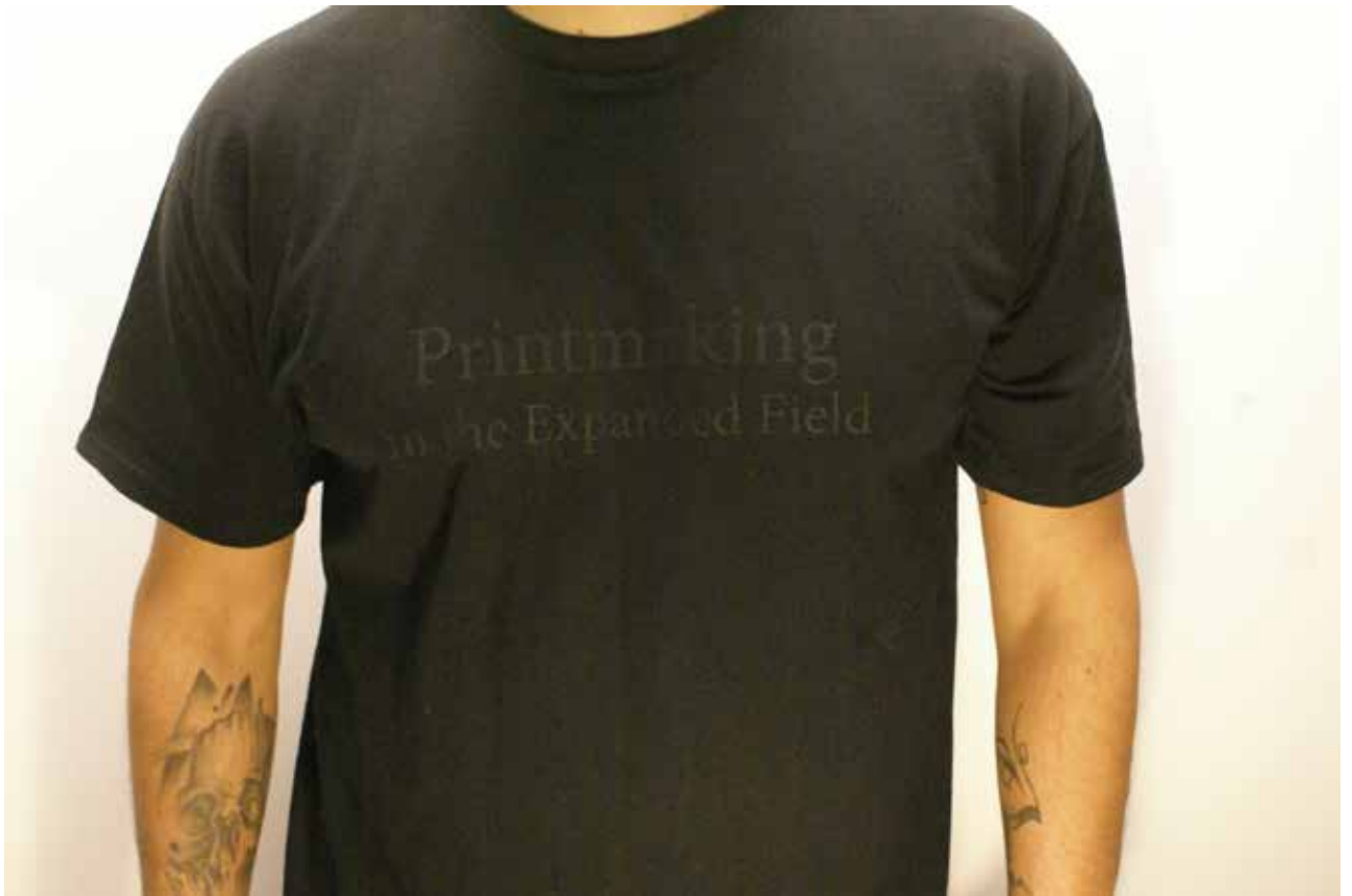
T shirts worn by staff and student crew during the seminar