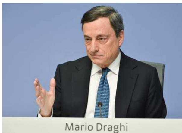
Trigger happy president?

Draghi also announced another round of quantitative easing – the introduction of new money into the economy. It is the eleventh attempt to reignite money supply growth since he took the helm and will increase the current injection of €60 billion a month to €80 billion each month.