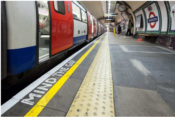
Wheely inaccessible.

In many stations – particularly on the Piccadilly line – the issue was the height difference or the gap between the platform and the carriage floor. Changing the position of the platforms would have been disruptive and costly. So instead, platform ramps were installed across four stops on the Piccadilly line, while manual ramps were provided at 16 strategic stations, to make it easier for wheelchair users to get on and off the train.