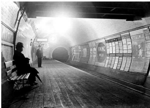
Queensway tube station, circa 1900.

Finally, the transport system needed to be flexible enough to accommodate the extra short-term influx and diverse needs of disabled people, and revert back to more “standard” operations after the event. For a transport system first developed in the mid-1800s, these were no small demands.