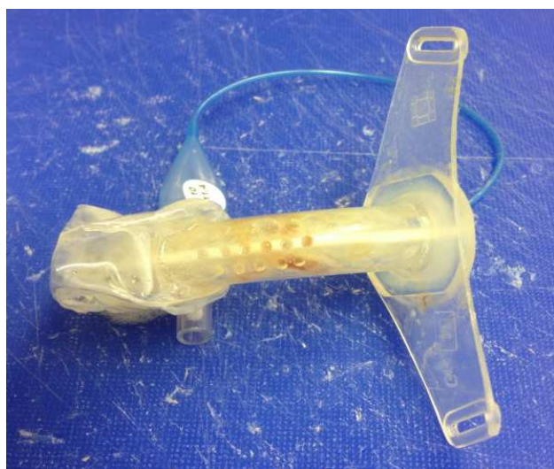
Figure 1: Freshly removed cuffed tracheostomy tube (Heimomed Prima-Phon II, size 8) after 72 hours of wear

Sixteen polymer tracheostomy tubes (8 un-cuffed and 8 cuffed, by Heimomed®, Kerpen, Germany and Teleflex Medical®, Kernen, Germany) were obtained from hospitalised in-patients directly after use. Un-cuffed tubes were changed and collected after minimum of 1 day of use, cuffed tubes after a minimum of 3 days of use (Figure 1). All tubes were tested before and after manual cleaning, and were assigned to three different additional cleaning procedures following their consecutive random collection order.