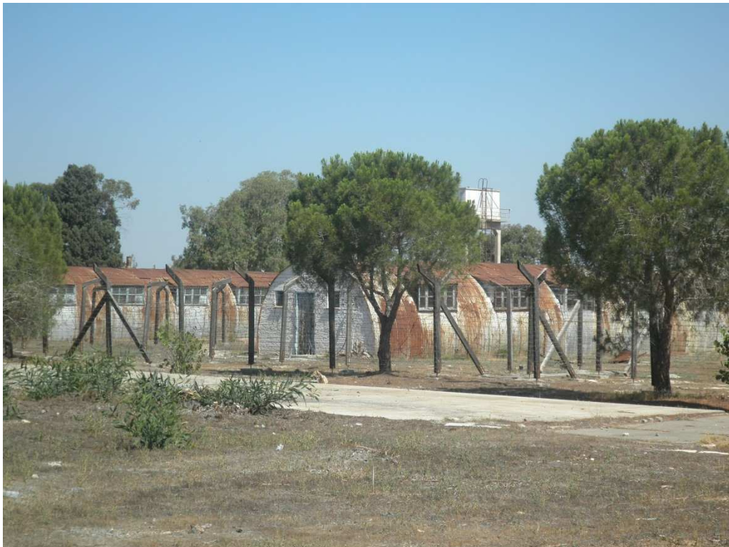
Figure 4: 'Camp K'