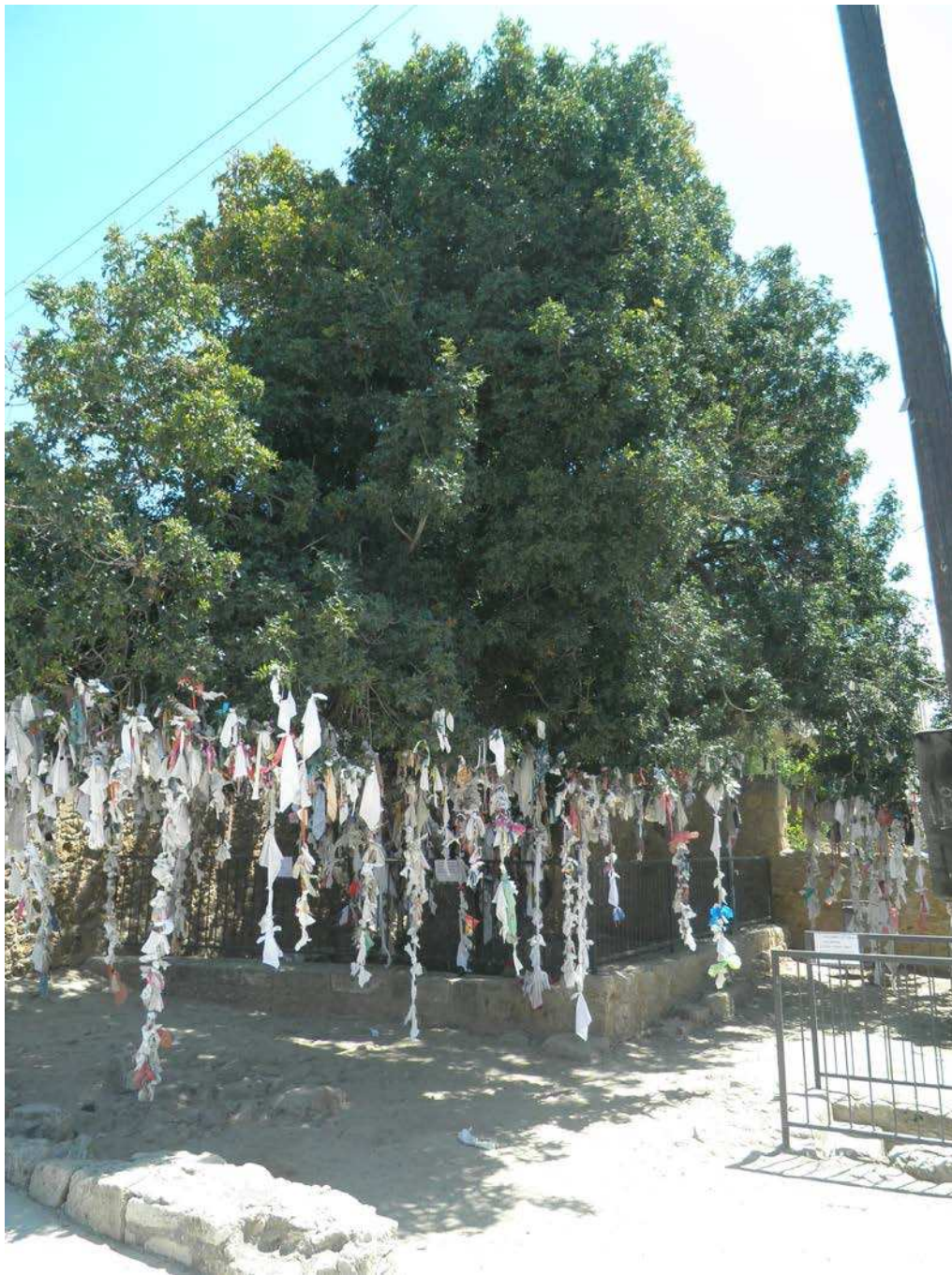
Figure 2: The 'Tree of Handkerchiefs' overhanging the catacombs of Solomoni in Paphos, Cyprus.

sums up the dilemmas facing Cypriot society in the sixteenth century, but also in the centuries to come.