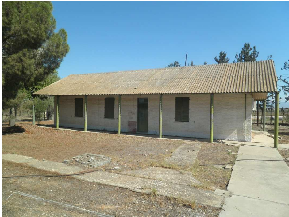
Figure 3: Barrack at 'Camp K' detention camp, Kokkinotrimithia, Cyprus, where my father spent most of his detainment.