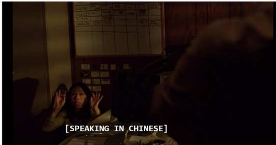
FIGURE 5.3: SCREENSHOT SHOWING THE PORTRAYAL OF SPOKEN MANDARIN

In this scene, the character of Mike has broken into a chemical company in which the only two employees are Chinese. These employees exchange panicked words in Mandarin which are unsubtitled in both versions. Because Mike does not speak Mandarin, this is reflected in the subtitles – the spoken Mandarin is not relevant to the plot, so viewers are not necessarily missing out on any important information and for bilingual viewers, the exchange is simply a bonus. Similarly, if the context of an utterance is obvious from other (non-linguistic) elements, and the actual spoken words are relatively easy to understand, we may see that this subtitle format may still be used: