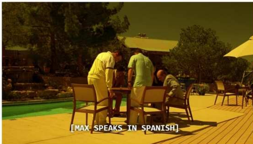
FIGURE 5.4: SCREENSHOT DISPLAYING SPOKEN SPANISH, REPRESENTED BY THE SUBTITLE TRACK [1/4]

In this scene, Max is thanking one of the other men at the table, a high ranking member of the Mexican Cartel – his spoken audio is simply 'Gracias', Spanish for 'thank you'. This is a relatively well known utterance, even amongst viewers who are not fluent in Spanish; this is particularly the case within the context of the United States, which has the second largest hispanophone population in the world (Burgin, 2015), meaning that even non-fluent viewers may recognise basic words.