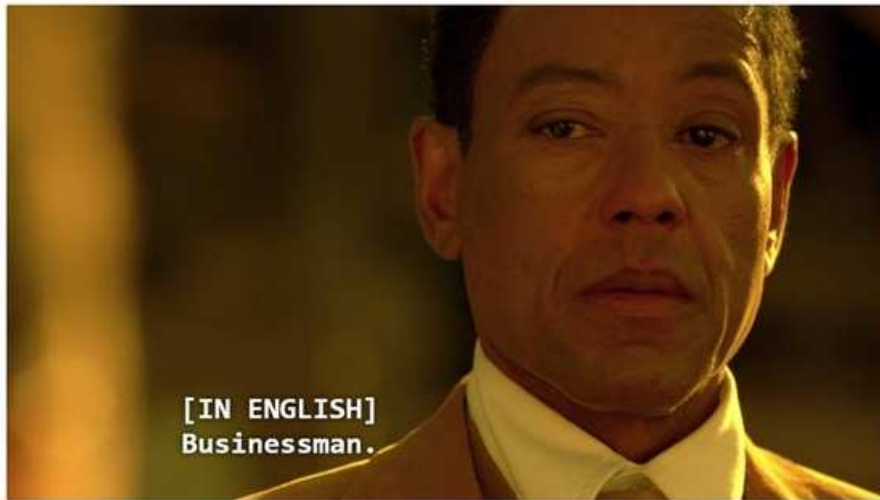
FIGURE 5.7: SCREENSHOT DISPLAYING SPOKEN ENGLISH, REPRESENTED BY THE SUBTITLE TRACK

And even if the utterance directly afterwards switches back to Spanish, it is still tagged using squared brackets once again: