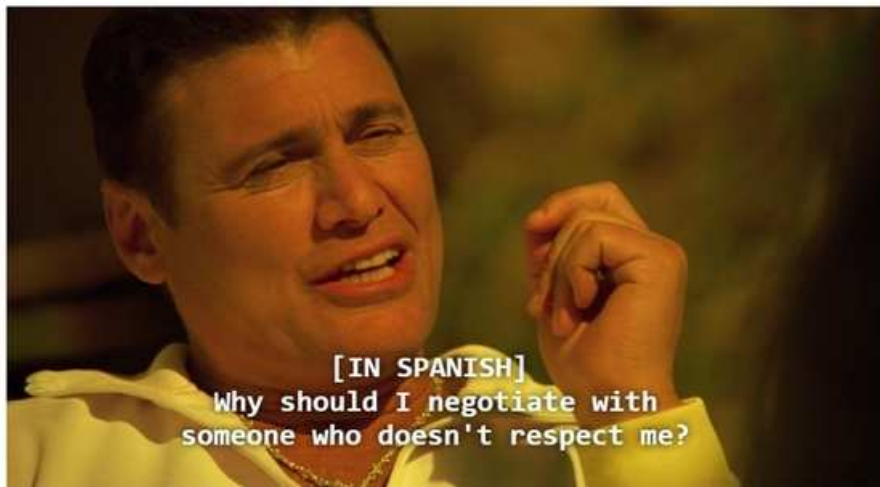
FIGURE 5.8: SCREENSHOT DISPLAYING SPOKEN SPANISH, REPRESENTED BY THE SUBTITLE TRACK [4/4]

And even if the utterance directly afterwards switches back to Spanish, it is still tagged using squared brackets once again: