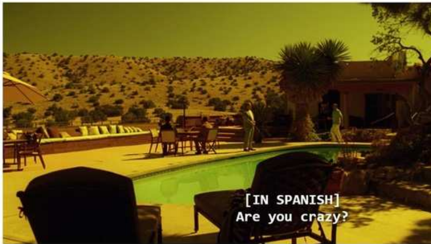
FIGURE 5.6: SCREENSHOT DISPLAYING SPOKEN SPANISH, REPRESENTED BY THE SUBTITLE TRACK [3/4]

Because all of characters in this scene understand Spanish and speak it almost throughout, we as viewers are also required to 'understand' it – their speech is relevant to the plot, and so is necessary for the viewer to understand the content regardless of whether they speak Spanish or not. This exchange is always expressed using interlingual subtitles in the show, regardless of whether the viewer is using DHOH subtitles to watch. If the viewer is using DHOH subtitles, the language switch is identified using squared brackets once again – the first utterance of each subsequent character speaking Spanish is tagged using squared brackets, and is then subtitled regularly without the [in Spanish] clarification until a character shifts back to English. If this change occurs during the same scene, the squared brackets reflect this change: