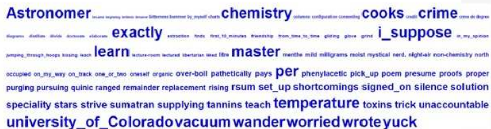
FIGURE 5.28 WORD CLOUD SHOWING GALE BOETTICHER'S KEY DOMAINS

Gale was the hardest character to analyse for significance – both of his corpora contain the lowest number of words out of all of the characters, making it far harder to analyse how significant his words and key domains are. If we view Gale's key words in Wmatrix, we see that there is a great number of words marked for keyness, although further investigation reveals that many of their log likelihood numbers are very low: