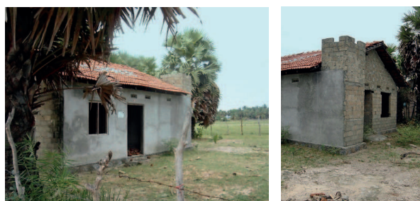
Fig. 6. External plastering not specified under habitable finishes

Although habitable finishes were included within the minimum housing standards, many beneficiaries failed to accomplish the finishes with the grant provided. The failure to accomplish habitable finishes appeared to have resulted from the mismanagement of housing reconstruction by some of the housing implementing agencies. Such agencies tended to plaster external walls to misrepresent the completion of reconstructed houses, spending the limited finance on external finishes rather than on essential internal finishes. Figure 6 shows such external plaster works in reconstructed post conflict houses.