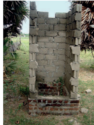
Fig. 1. Incomplete sanitary facilities

“Rs. 335,000 grant was given to construct a habitable house including the toilet. Some people have not constructed the toilet and that money also spent for the house (BE)”.