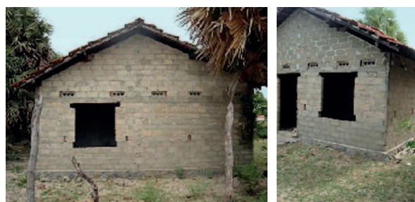
Fig. 5. Incomplete door and window frames

Although habitable finishes were included within the minimum housing standards, many beneficiaries failed to accomplish the finishes with the grant provided. The failure to accomplish habitable finishes appeared to have resulted from the mismanagement of housing reconstruction by some of the housing implementing agencies. Such agencies tended to plaster external walls to misrepresent the completion of reconstructed houses, spending the limited finance on external finishes rather than on essential internal finishes. Figure 6 shows such external plaster works in reconstructed post conflict houses.