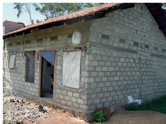
Fig. 2. Doors and windows covered with temporary sheeting

As a result, these beneficiaries were sharing neighbourhood sanitary facilities or defecating in nearby jungles posing health threats. Habitability of post conflict housing is also threatened through the lack of protection from weather. Since the specification of habitable finishes limited the door and window sashes for a bedroom, other doors and windows were left without sashes and thus led to a lack of protection from wind and rain. While some beneficiaries covered the doors and windows with temporary materials (refer to Fig. 2), such measures were not taken by most beneficiaries and they blamed this on the limited finance grant provided by the agencies.