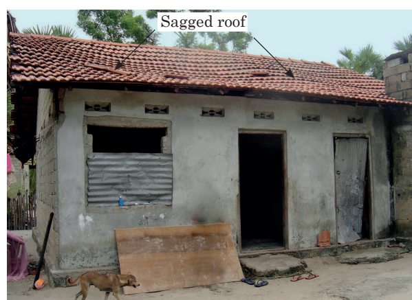
Fig. 3. Sagged roof

“This is my house. This was constructed in 2007. Can you see, its’ roof is sagging. Coconut beams were used for the roof and these beams sagged due to the load of the roof. Therefore the roof also sagged (BE)”.