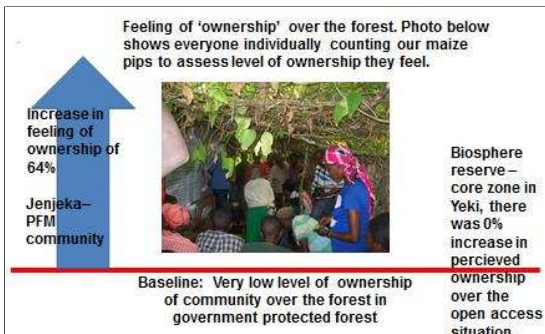
Figure 2. Change in the feeling ownership by the community for PFM and BR.

A summary of the comparison between PFM and BR as understood from consultations of community and other actors is shown in table 1.