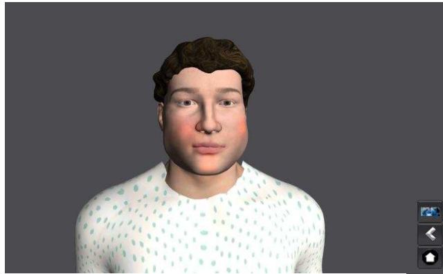
Fig. 5. Swelling after the surgery

knowledge of complications that are involved. To further explain the surgery, verbal instructions without scientific jargon were recorded using Avid Pro tools (21) and Apple Garage Band.