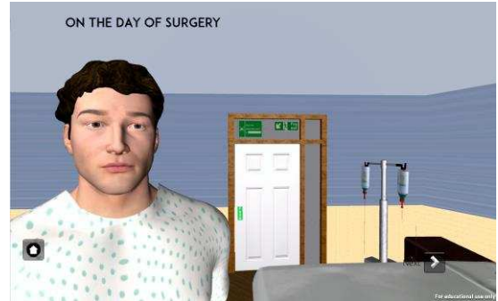
Fig. 2. Patient in hospital gown

In the design of surgical procedures, five surgeries namely, the upper jaw surgery, lower jaw surgery, double jaw surgery, chin surgery and bone graft from hip were represented. This section contains interactive 3D animations that demonstrate bone cuts, movements and final rigid fixation. Patients can also visualize the pre and postsurgical variations for each procedure with the help of a slider interactively as shown in the Fig.3.