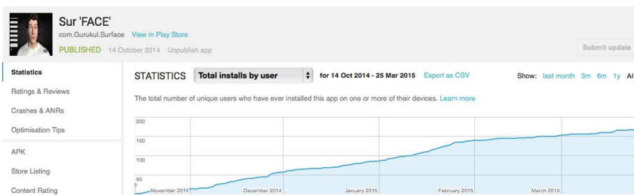
Fig. 6. Statistics showing total user installs of Sur-Face in a month wise manner.

Google Play store and iTunes Store distributes the apps developed for Android and iOS platforms respectively (24). A developer account was created before exporting Sur-Face app into the app store. Once the upload was done, the cost was set to free and in 24 hours, it was made available for download. The app was downloaded 167 times till date with most number of downloads from Brazil followed by Russia and United Kingdom. Figure 6 shows the statistics of total installs by users in a month wise manner as represented in Android developer portal.