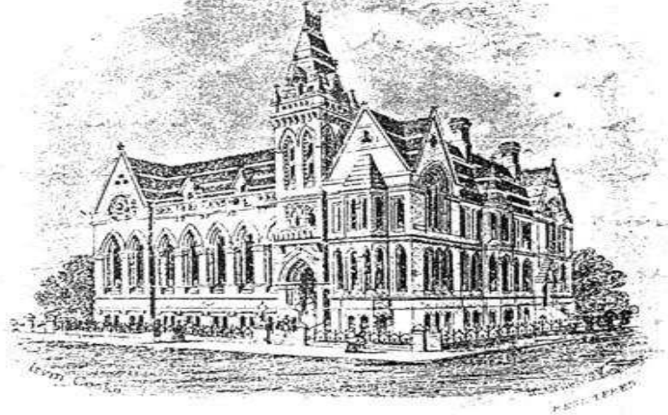
MECHANICS INSTITUTION AND SCHOOL OF SCIENCE AND ART, KEIGHLEY.