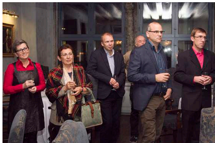
ABOVE: The annual ANDROID network conference was held in Tallinn, Estonia and the first opportunity for all partners to meet and discuss the network's ambitious workplan