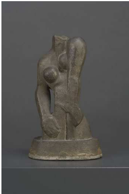
Figure 1. Henry Moore, Torso , 1926 (LH37). Cast Concrete.

In 2012, the Henry Moore Foundation acquired Torso , an early 1926 concrete carving of Moore’s (Figure 1). Only 21.6 centimetres high, Torso is one of a series of ‘technical’ experiments Moore undertook between 1926 and 1934. These early experimentations in concrete test the limits of new materials alongside more established methods and practices of sculptural production. Featured in the Moore