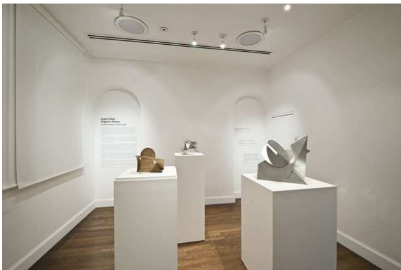
Figure 6. Henry Moore Institute. Lygia Clark: Organic Planes , Exhibition 24 September 2014–4 January 2015.

physically experienced, such as heaviness and lightness, fullness and emptiness, warmth and cold, light and dark. 42