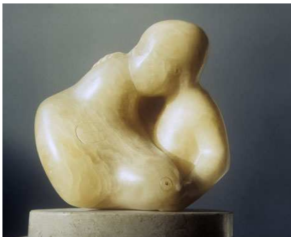
Figure 2. Henry Moore, Suckling Child , 1930 (LH96 Alabaster).

Suckling Child shortly after ‘had a strange afterlife as a virtual reincarnation’ in the alabaster carving in Epstein’s possession. 16 The transmigration of a concrete memory into alabaster is not without significance, nor is Epstein’s role in this process. For Wagner, Moore’s reworking of Suckling Child through the use of another material, is also a transformation which puts the meaning of the former concrete version under some kind of erasure, and this, she argues, is part of Moore’s retreat from the ‘maternal sign’ to ‘the public economy of male identity, at least in its high modernist form’. 17