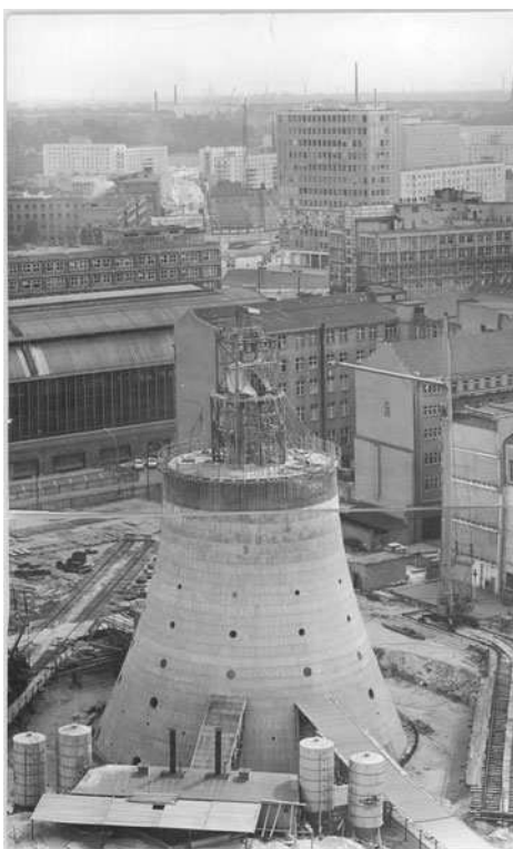
Figure 4. [Image of the construction of the Berlin Transmission Tower – General German News Service (GDR)], 23 June 1966 (Bild 183-E0623-009-001).