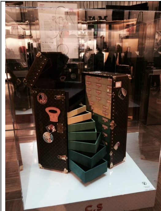
Image 1: Le Fils Rouge, Espace Louis Vuitton, Paris