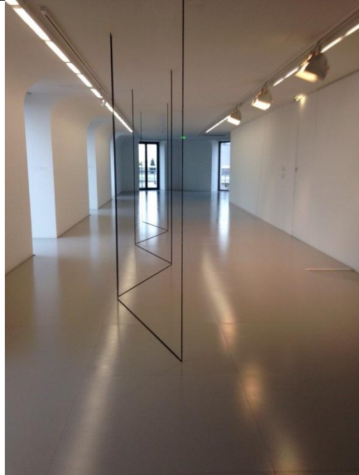
Image 2: Untitled by Fred Sandback, Espace Louis Vuitton, Paris