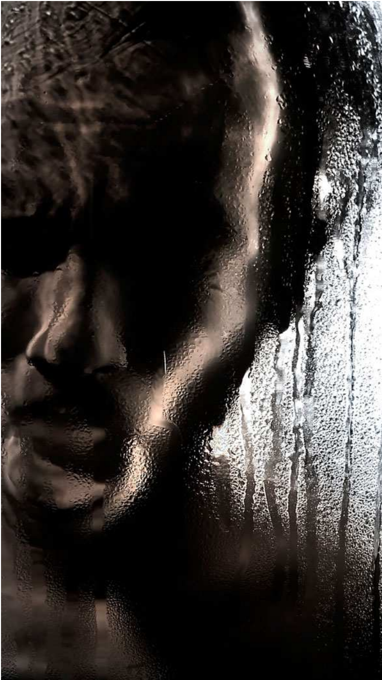
Figure 9. Christine Borland, NoBodies , (Detail) Choking Charlie , 2009, Film Still, 10 minute loop, monitor.