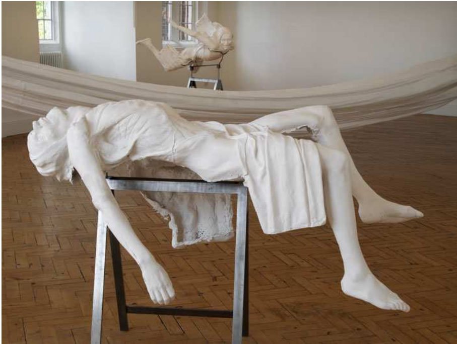
Figure 6. Christine Borland, Cast From Nature , 2011, Camden Arts Centre.

looked to the heavens but stared ahead with a languid but superior menace. Two figures, one classically reposed after death in contrast with the other, caught in the fast race towards death set in a room with an almost imperceptible even settling of fine chalk dust. Plaster is heavier than other dust motes.