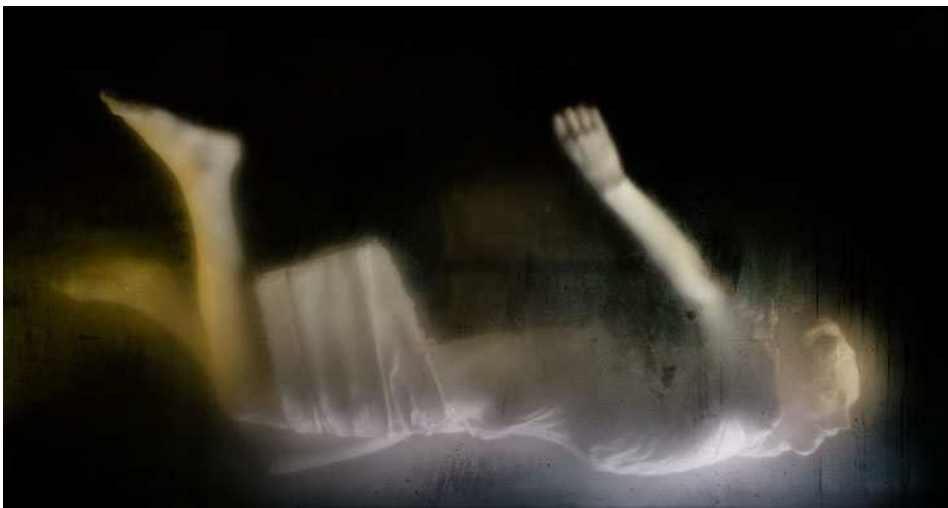
Figure 2. Christine Borland, Film Still – NoBodies; Cast From Nature , 2011, 12minute 30 second loop, H.D. Video, projected. (Made possible by The Morton Award for lens based media, 2010)

From the beginning of the Glasgow Sculpture Studios exhibition (late 2010) to the exhibition at Camden Arts Centre in May 2011 Borland seemed perplexed by her fascination with the plaster cast and sought to apply this in exhibition arrangements