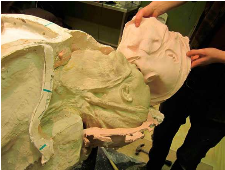
Figure 5. Christine Borland, Cast From Nature , Glasgow Sculpture Studios, 2010, Casting in Progress.