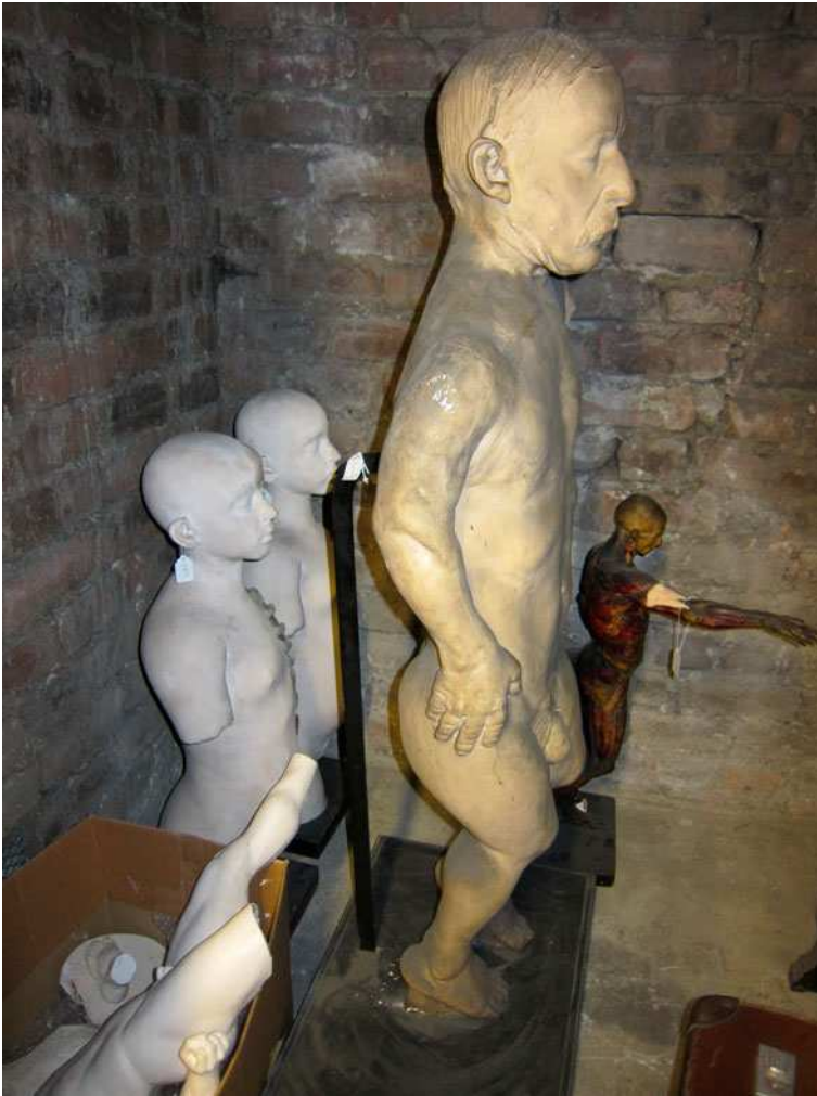
Figure 7. Basement, Edinburgh Anatomical Museum Stores.

Richardson: With nothing catalogued and no proper documentation, how did you set about finding this lost plaster cast?