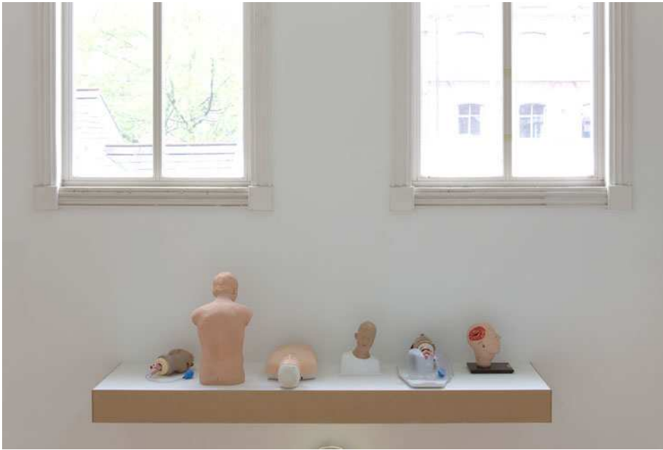
Figure 3. Christine Borland, SimBodies & Nobodies , 2009, Detail, Medical Manikins.