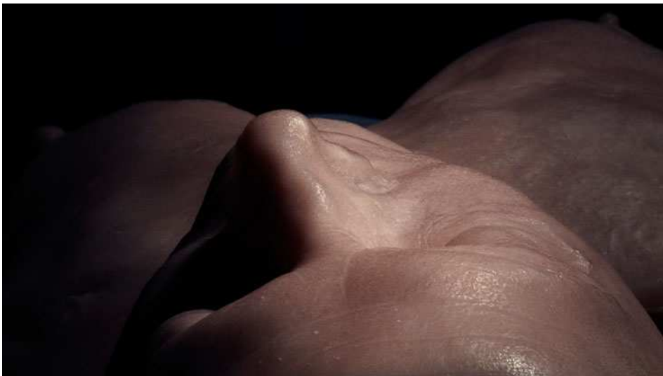
Figure 8. Christine Borland, SimWoman , 2010, Film Still, 12minute 30 second loop, H.D. Video, projected.

B: I feel a certain relief as well and it's been built into the decision-making that I'm not actually physically representing the spectacle of the sculpture as part of the show, in its raw, broken and undignified form – there's plenty of that conveyed in this mediated