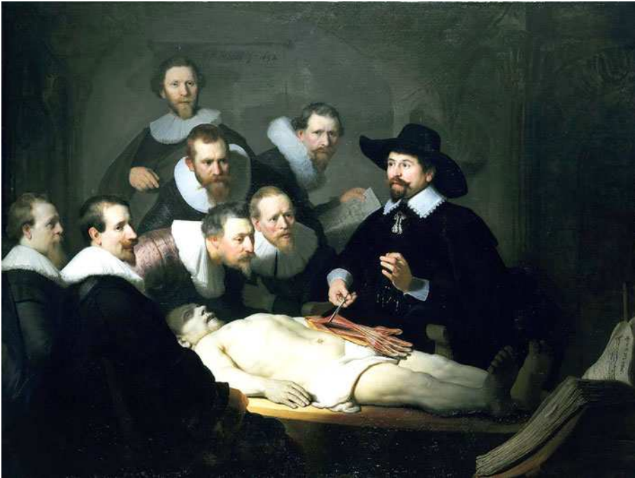
Figure 1. Rembrandt van Rijn, The Anatomy Lesson of Dr. Nicolaes Tulp , 1632, (detail). Collection of Royal Picture Gallery Mauritshuis, The Hague.