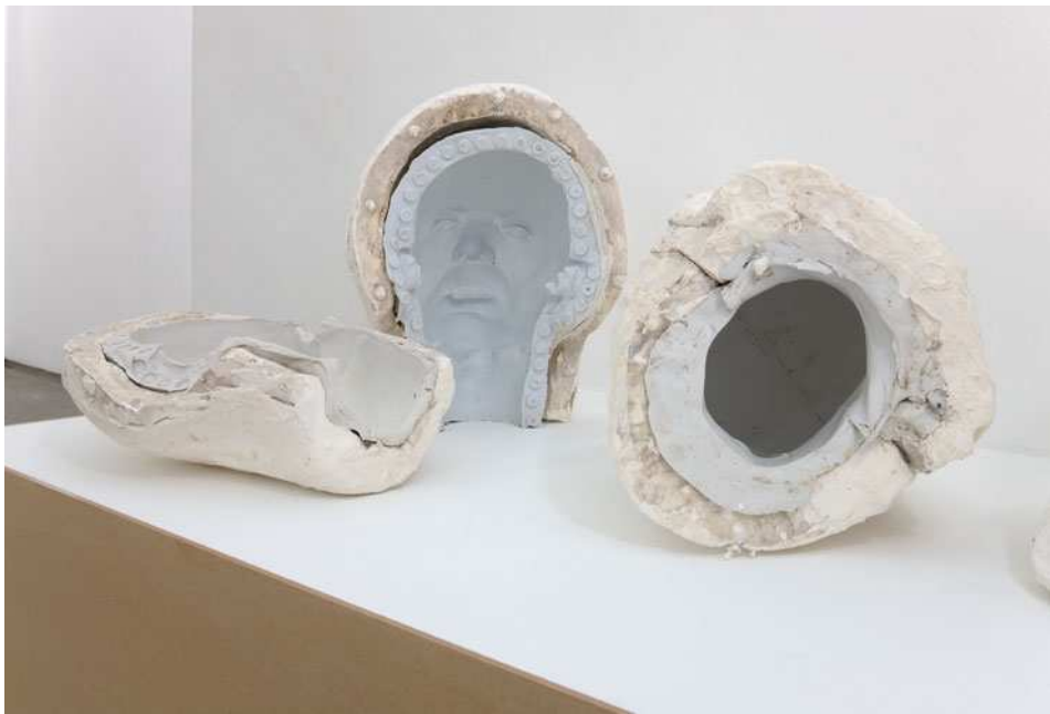
Figure 4. Christine Borland, SimBodies & NoBodies , 2009, Detail Plaster & Silicon Moulds.