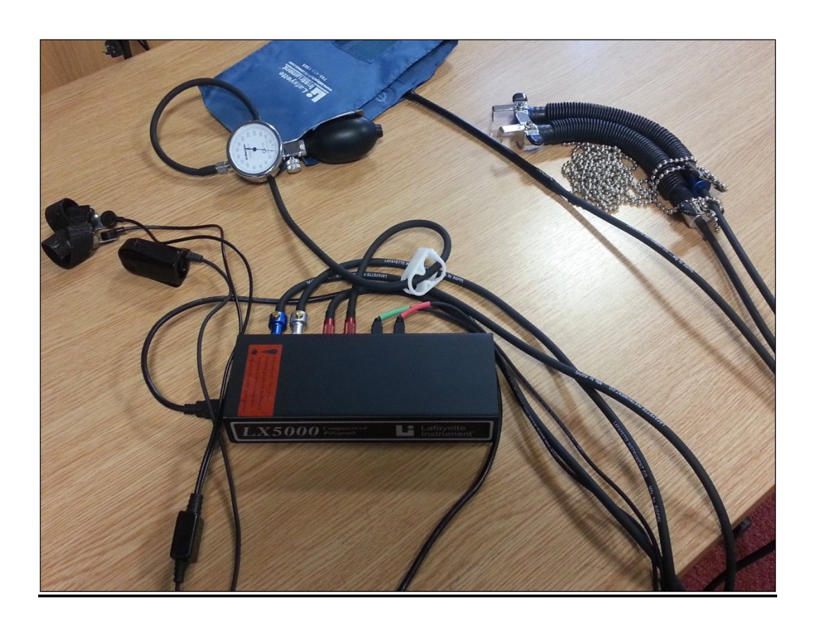
Figure 2: Polygraph Equipment

In addition to the three channels mentioned above a range of other compatible tools can also be utilised. The most widely used to these are "activity sensors", which can include