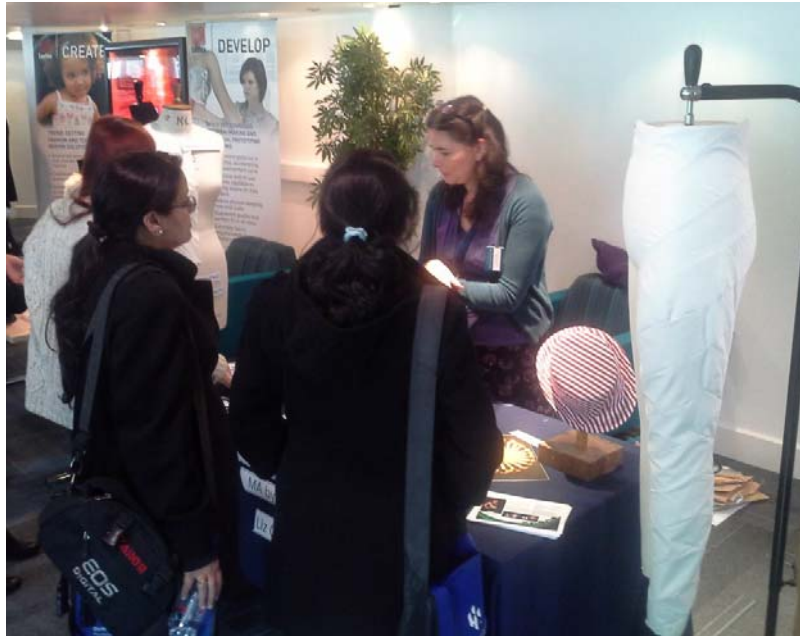
Figure 13. A stall at the First International Symposium for Creative Pattern Cutting, demonstrating the second skin method to conference delegates in 2013.