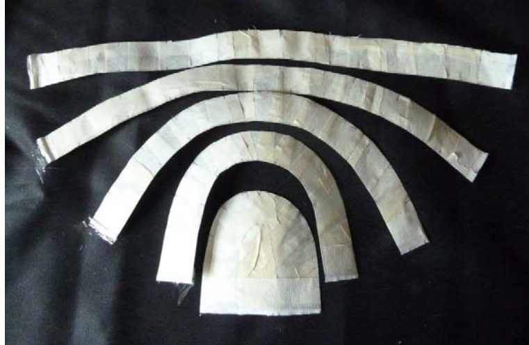
Figure 2. The pattern developed from the hat block created an accurate fit and provided an ideal starting block to produce further styles.