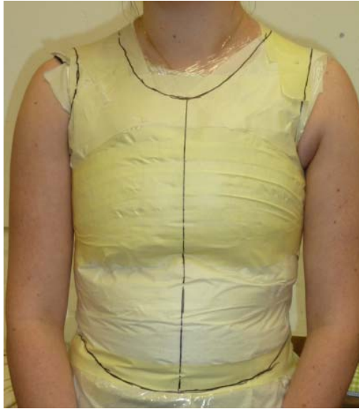
Figure 8. Front view of the bust suppression bodice. The masking tape was applied from the top of the body and concentrated on pulling the breasts in.

Drawing a dart from the underarm seam to the bust point did not allow the pattern to lie flat, due to the shaping under the bust. The pattern was then made up in the fused polyester cotton and fitted on the model.