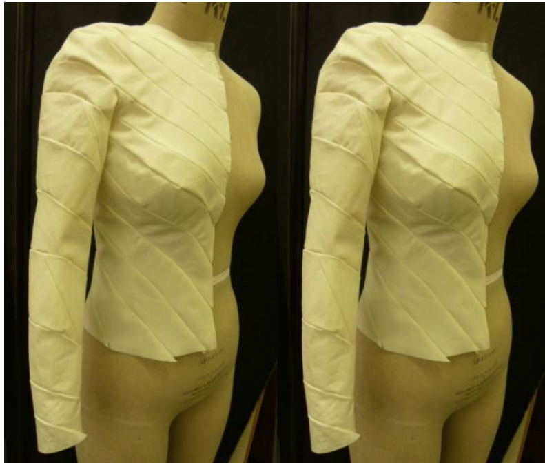
Figures 4 and 5. Front and back views of twisted torso made up in fused poly cotton. This cutting method proved to be a successful way to create an accurate contoured second skin from the model.

create the individual pattern pieces. Each piece was made up in fused, polyester cotton, which eliminated stretch and allowed for seams to be cut short and left unfinished (Figures 4 and 5). The stiffness and strength of the fabric also gave the garment some structure. This cutting method proved to be a successful way to create an accurate contoured second skin of taken from the model. The technique enabled the development of interesting, flowing style lines, unachievable through flat pattern drafting and cutting on the stand. As a garment however the end result was difficult to wear as the sleeve was too tight to allow the hand to travel through. This problem could be resolved by making up the design incorporating a fastening such as a zip into the sleeve. The style lines on the curved side of the body proved more successful than that of the princess line due to the majority of seams, which permitted a more accurate fit.