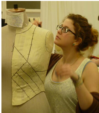
Figure 10. A costume student experimenting with the mould technique on a dress stand.