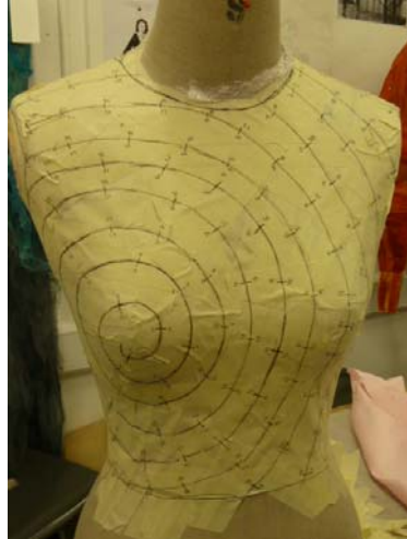
Figure 9. Example of a creative, spiral cut bodice made by costume students experimenting with the mould technique.

previously struggled with pattern cutting and felt restricted through their lack of experience were able to develop accurate patterns for complex designs with eye-catching style. Two student styles are illustrated in Figures 9 and 10.