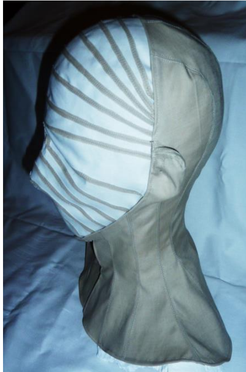
Figure 14. A side view of the head and face mask, positioned in the middle of the table at the pattern cutting symposium, 2013.

them. The overall impression gained was how fascinated people were, with the methods used and their results. Many of the delegates asked whether there was a publication or blog regarding the method and a number asked if the authors would be interested in running workshops.