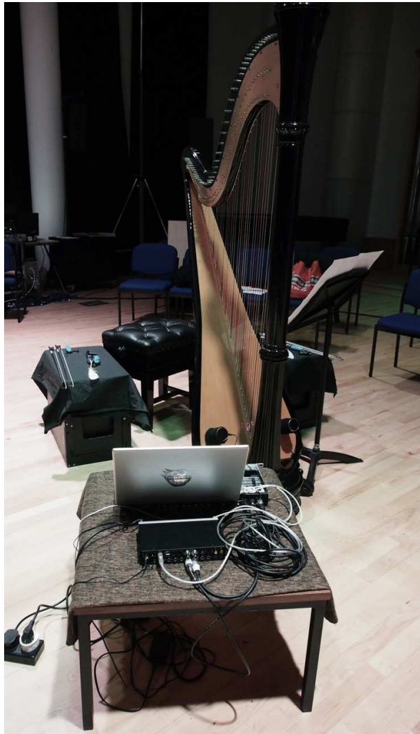
Figure 6: harp and speaker setup for performance.

now functions as a sounding object, in addition to a musical instrument (see Figure 6). If a performer plays live, as an 'outside' harpist, in addition to the 'inner' part, the resonant frequencies caused by the electronic track and by the live performance radiate together from the same source, and also directly interfere with each other. As with the box, the sound of the playback is slightly transformed by the resonance of the harp.