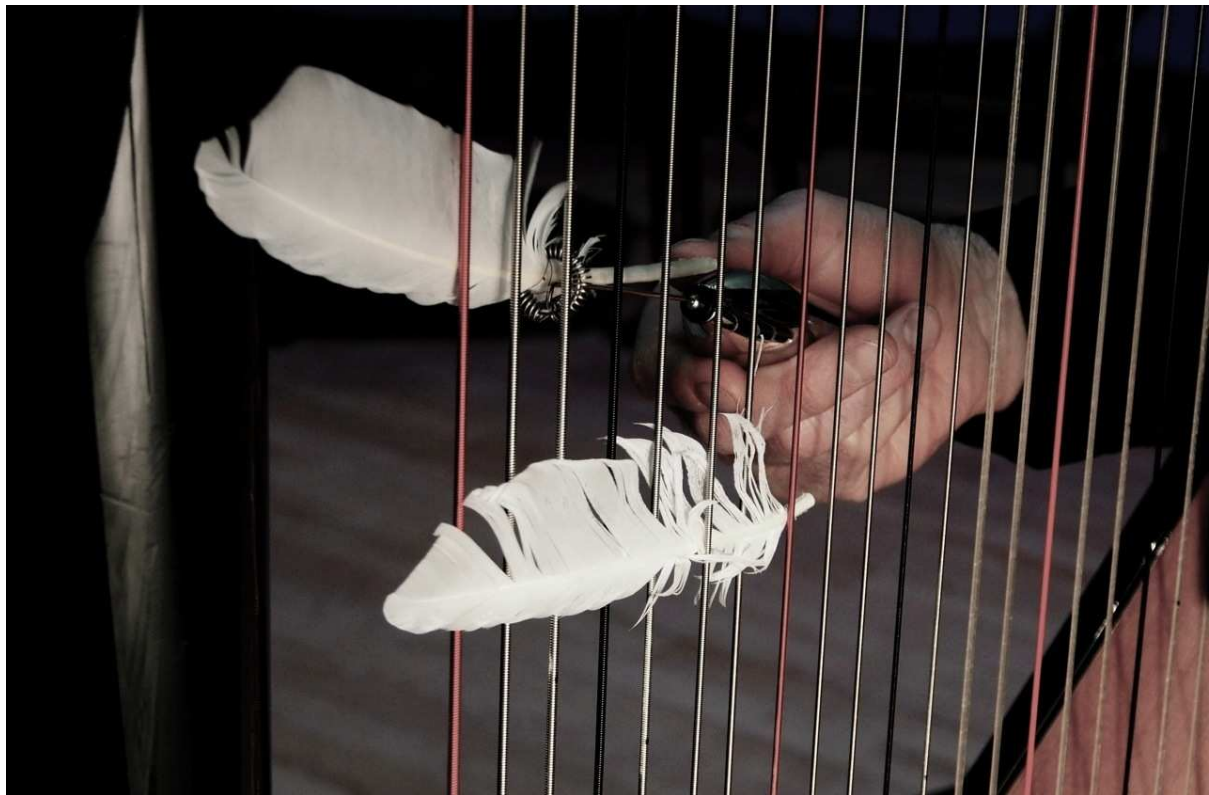
Figure 9: Feathers as tools for sound production.

discovered some interesting sonic results such as a soft vibrating flutter, produced by stopping a vibrating metal string with the tip of a feather. This produces a sound a little like that of wings against a cage. Harpist Rhodri Davies brought up the idea of rotating feathers with an electric milk whisk, which not only gives beautiful sonic results, but is also visually effective on stage. White feathers rotate like the wings of a humming bird (see Figure 9). Feathers provide abundant symbolic imagery, resonant of freedom and artistic expression. For hundreds of years they have been used as tools, by writers, composers and in instruments (the strings of a cembalo are plucked with small pegs made from quills). Artists in former times often posed with a white goose feather in the right hand.