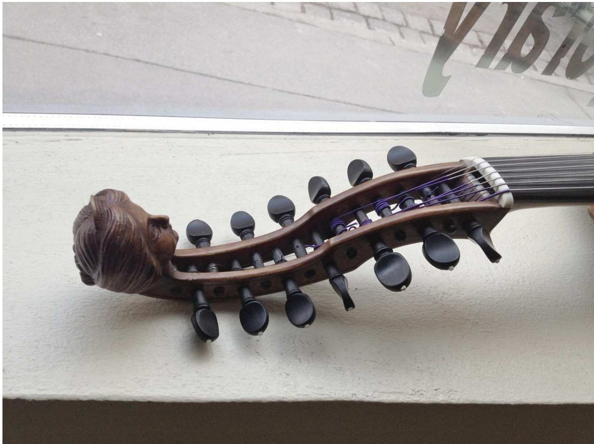
Figure 3: Historic viola d'amore owned by the company Thomastik-Infeld in Vienna.

like in the Vienna Philharmonic Orchestra in 1997 (Bennett, 2008, p.53). Instrument makers historically had a preference to decorate such instruments with female figurines or heads (see Figure 3). In the case of the viola d'amore, these figurines were at times blindfolded. The resonating strings are often referred to as 'sympathetic strings'. The viola d'amore was frequently used in feminine contexts, or in connection with female main characters, by (mostly male) composers such as Leoš Janáček, or in Bernhard Herrmann's film music. 2