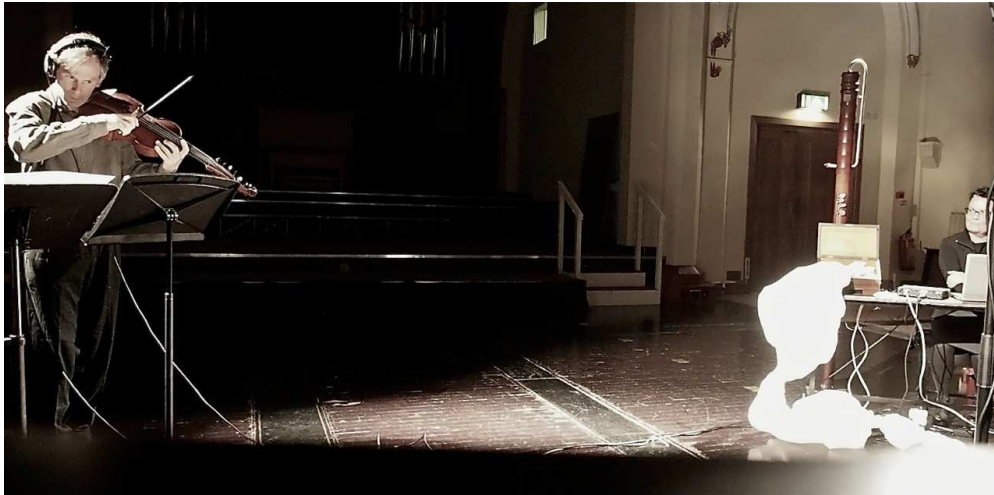
Figure 1: Garth Knox performing from an audio-score.

'GIB SIE WIEDER' began with the composition 'a warning commentary on resonance I', featuring Garth Knox performing on viola d'amore (see Figure 1). The second piece 'a warning commentary on resonance II' followed shortly afterwards and is dedicated to the harpist Rhodri Davies (see Figure 2).