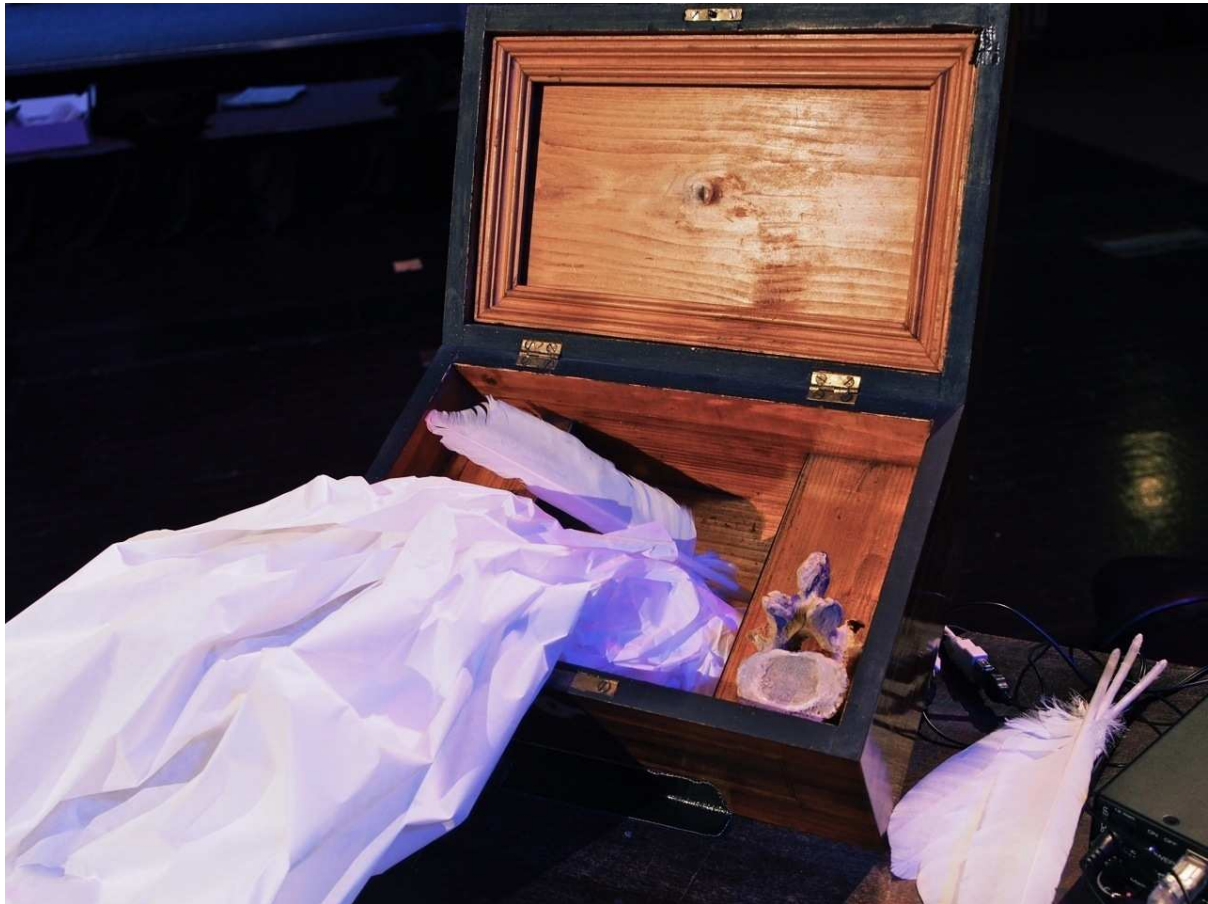
Figure 7: Sounding object for the transduction of the viola d'amore.

nonverbal input heard only by the performer and becoming increasingly foregrounded until it becomes a clearly audible female voice on stage.