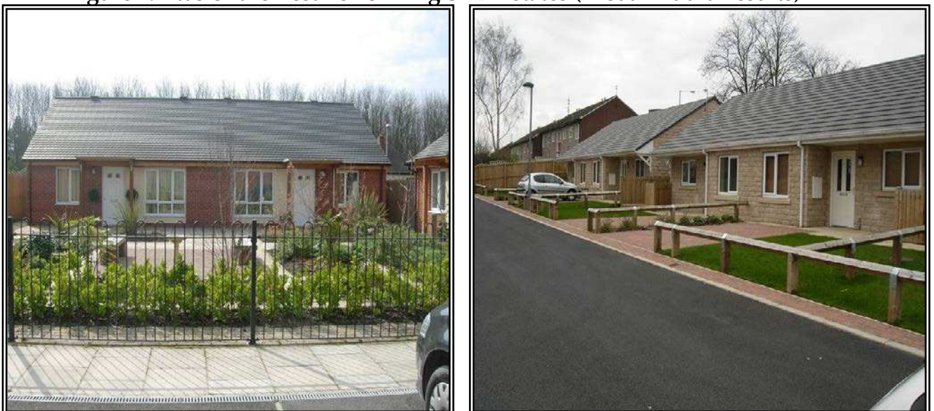
Figure 2: Two of the Best Performing SBD Estates (Visual Audit Results)

Of the 32 developments analysed, the best performing five developments (i.e. those with the lowest scores) were all SBD. The worst performing five developments (i.e. those with the highest scores) were predominantly non-SBD (only one was SBD).