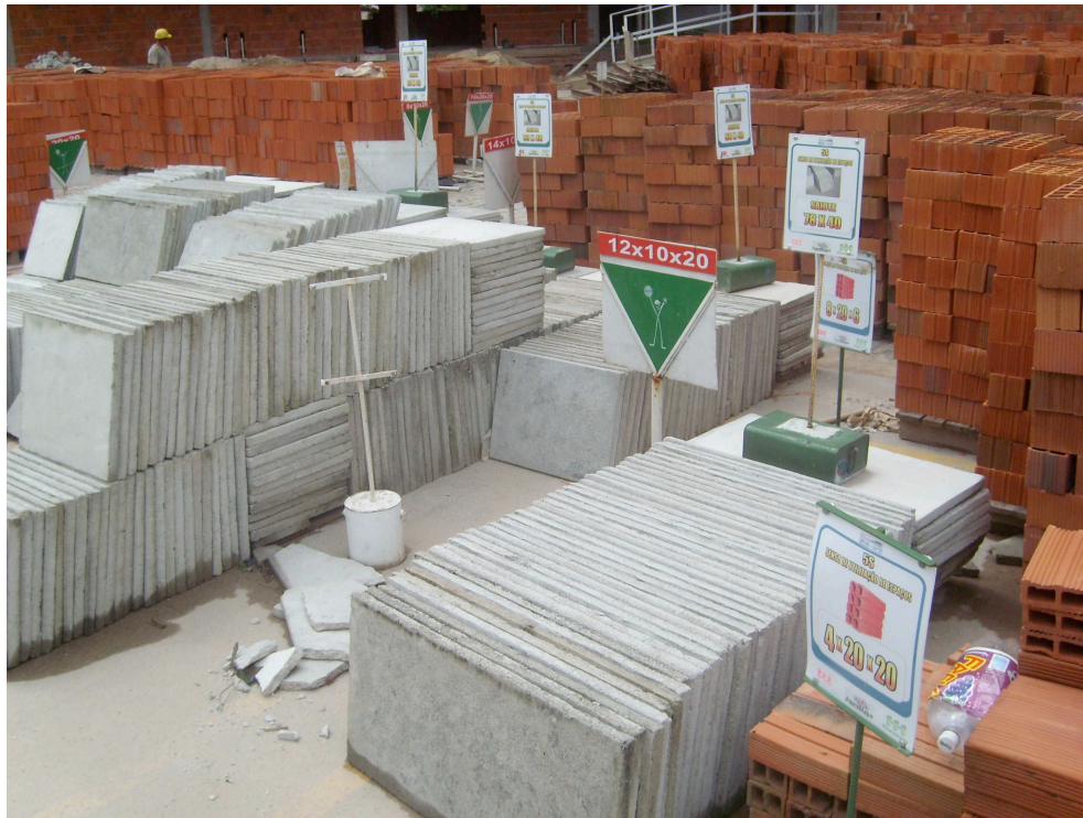
Fig. 2. Site stock material identification