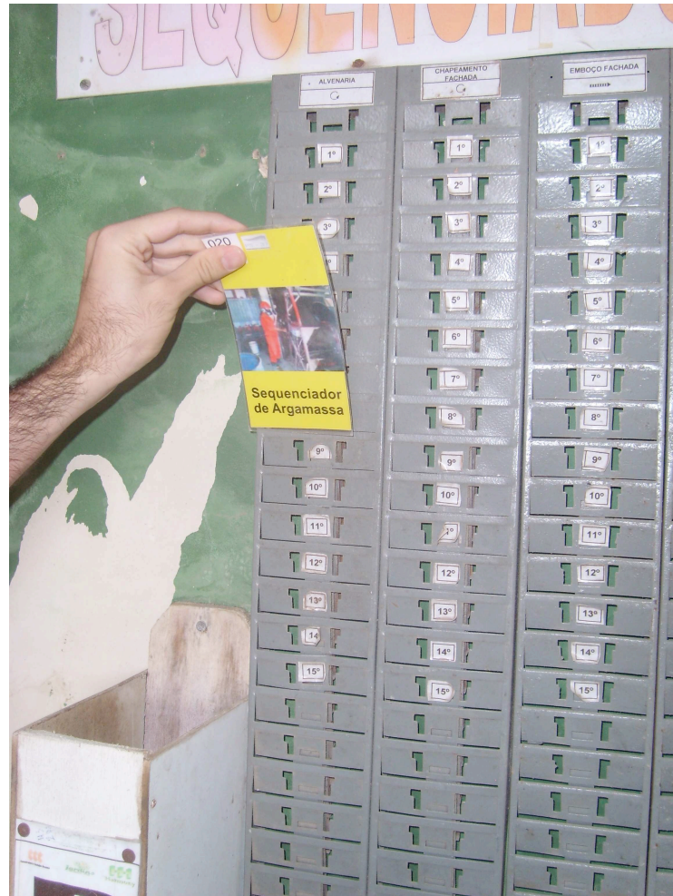
Fig. 1. Visual concrete production leveling example