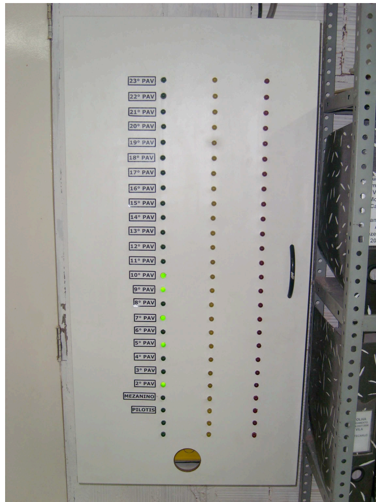
Fig. 4. Static andon board for in-station quality

Some companies used a mobile or static type of alarming systems called andon with the aim of identifying the deviations from standardized construction processes. The green, yellow and red lights on the systems (see Figure 4) indicate respectively that the work proceeds smoothly, help is required from the site manager, or the production stopped on a building floor.