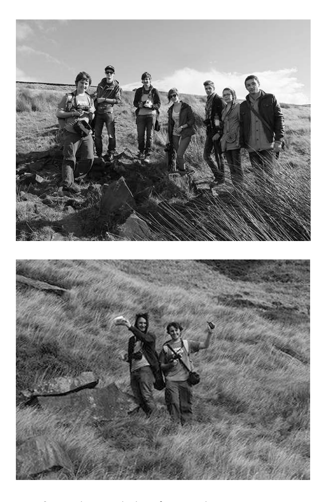
Fig. 7 & 8. Students on the hunt for geocaches.

Students are required to fumble in the bracken, walk off the well-trod tracks and experience the inimical environment. The search leads students to protected valleys and exposed windswept rock escarpments. Students who have chosen to ignore the requirement for appropriate footwear and clothing soon discover that the Peaks can be muddy, cold and very uncomfortable in plimsolls. The exercise is finished with a rewarding excursion to one of Marsden's pubs or coffee house.