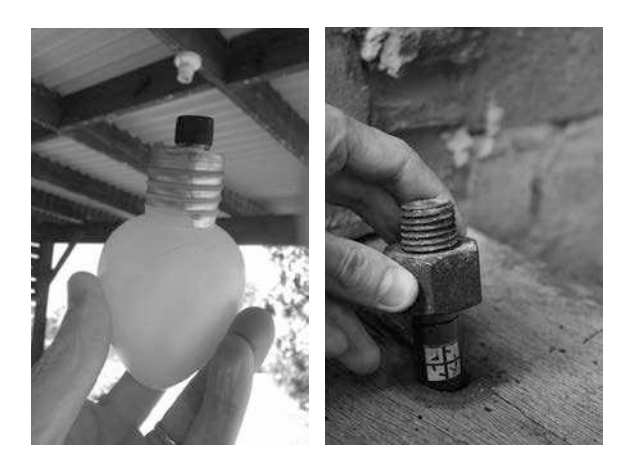
Fig. 1 & 2. A geocache disguised as a fake light bulb (left) and a geocache disguised as a bolt (right).

Geocaches can be planted by anyone, although participants are required to adhere to a comprehensive set of regulations specified at Geocaching.com<sup>3</sup> so as to avoid trespass or endangering the environment and enable fair play. Many geocaches have been hidden in remote areas or placed in such a manner that they are difficult to retrieve. Perhaps the geocache most difficult to retrieve is the one that is magnetically attached to the International Space Station travelling at 17000 mph at an altitude of 250 miles.<sup>4</sup> Other efforts to make retrieval more taxing include submerging geocaches in water and constructing containers that require specialist equipment to be opened.<sup>5</sup> Many geocaches require participants to solve a puzzle before the geocache's coordinates are revealed. Some geocaches can only be found by first finding clues that are themselves within geocaches; thus, one find can lead to a string of further discoveries.