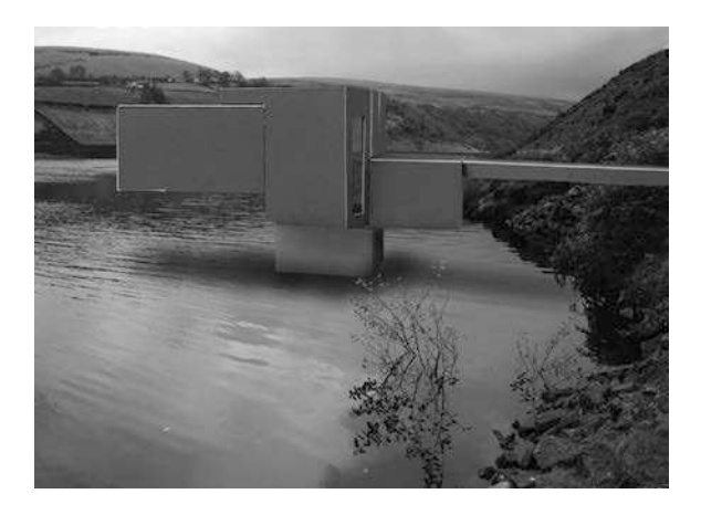
Fig. 10. Bothy project designed in specific response to the context. The elongated form points towards a view of a water gate tower that strides a dam.

The Geocaching Documents explains that the exercise is a prelude to a project involving the design of a bothy. The bothies are required to be located within the Butterley reservoir 5m from the shoreline, but at a location determined by the student. These bothies are to be placed on a 3x3m concrete pad that protrudes from the water surface by 1m. Each bothy is to be designed for a specific person of the student's choice (either a real person or a clearly defined refabricated person). These confines prompt students to grapple with social and anthropometrical restraints and the very practical need to provide shelter in a diverse and sometimes uncomfortable environment.