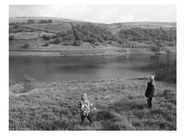
Fig. 9. Students en-route to a geocache, forced to walk through bracken on an exposed hillside.