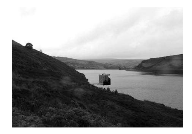
Fig. 11. Bothy project shown in context.