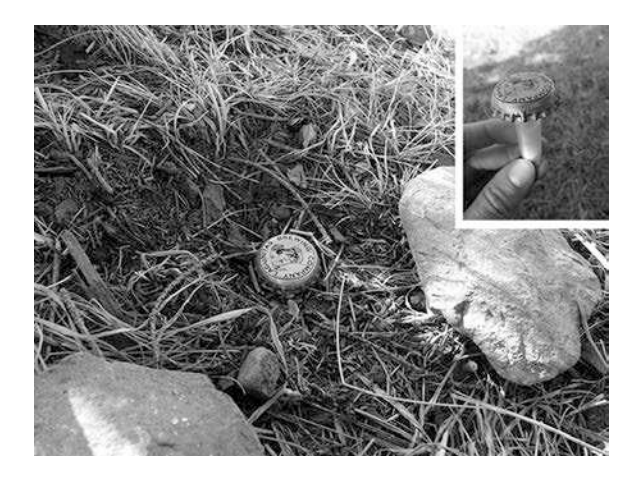
Fig. 3. A geocache disguised as a discarded bottle cap.