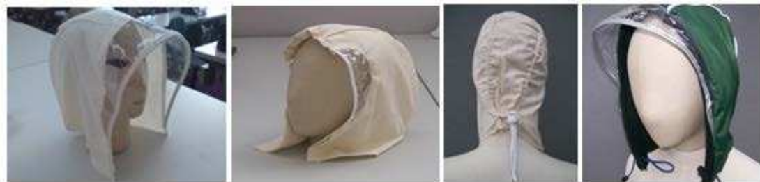
Fig. 2: Case study level 5 (2007-2008)