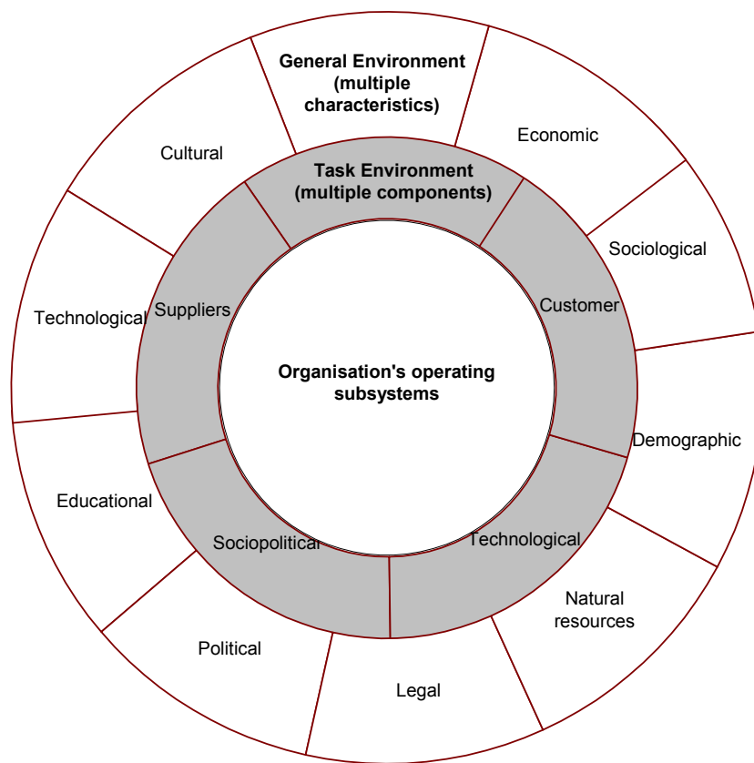
Figure 3: Relationship of general and task environments to the organisation.