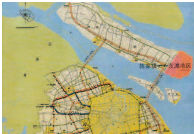
Fig. 6 Location of Chenjia Town together with Dong-Tan Area (East End of island).