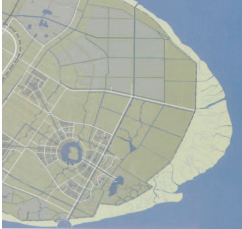
Fig. 1 Aero-picture of Shanghai and its islands (top left). Fig. 2 Master plan of Chenjia Town (top right). Fig. 3-4 Photos of Chong Ming island.