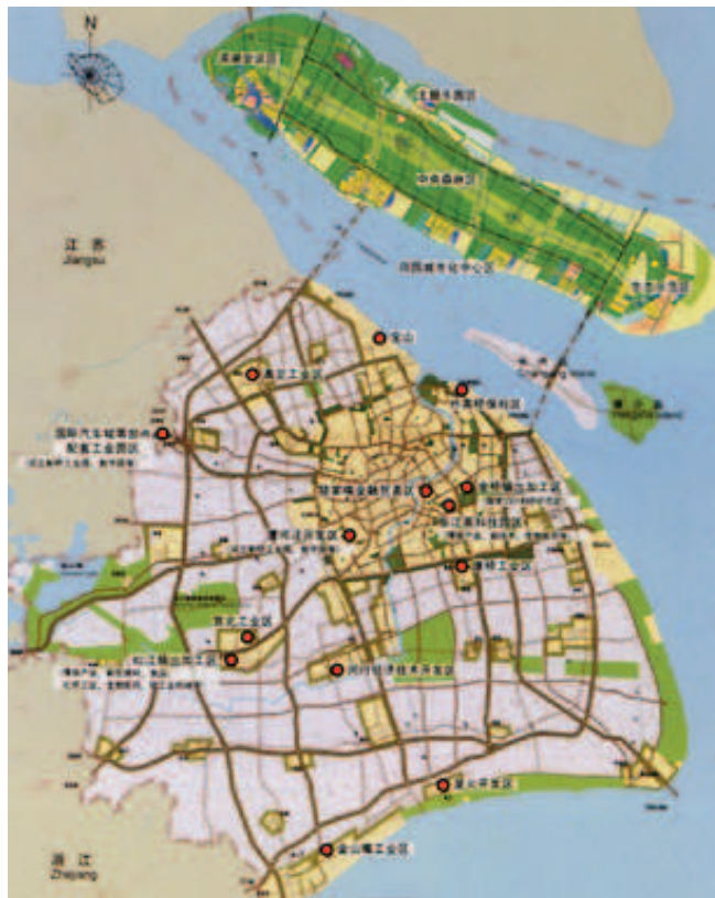
Fig. 5 Masterplan of full Shanghai territory (top).