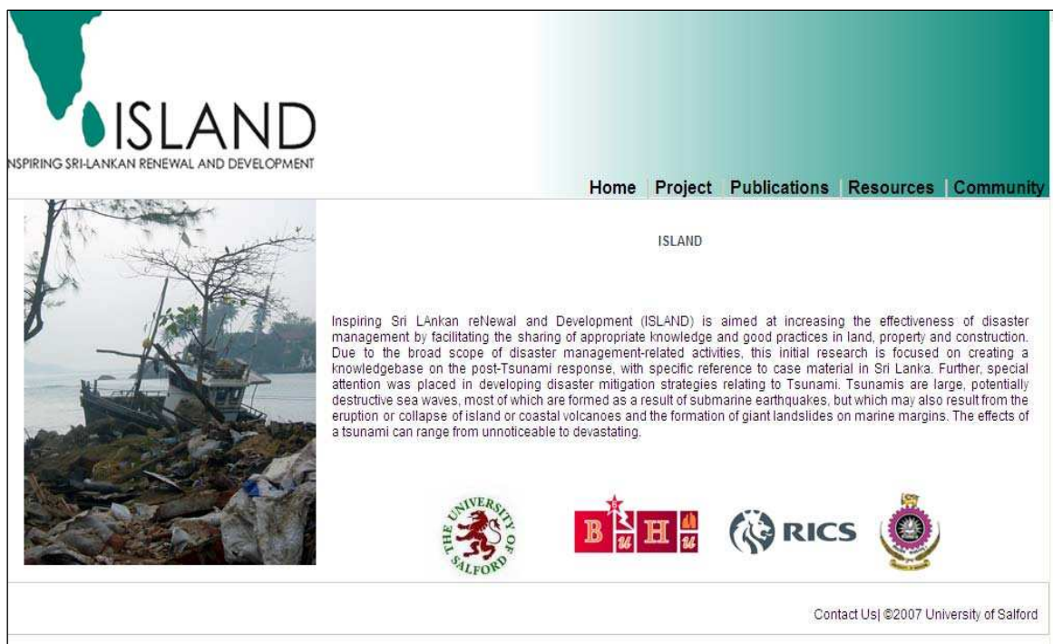
Figure 3: ISLAND website - Home page

As part of WP 1, the ISLAND web portal and knowledgebase was developed to capture, process, and disseminate the lessons learned from the Indian Ocean tsunami in the form of policy advice and good practices to guide future post-disaster interventions. Hence, the web portal provides an organised common platform to capture, organise and share the knowledge on disaster management strategies and create a versatile interface among users from government, professional bodies, research groups, funding bodies and local communities.