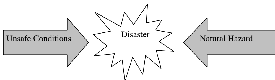
Figure 2: Components of a disaster

Thereby, the threat from natural hazards can only be minimised through the elimination of unsafe conditions, as much as possible, in terms people, property and infrastructure. The role of the pre-disaster risk reduction phase, also referred as development portion, is considered to be vital in bringing unsafe conditions to a controlled safe environment, through mitigation and preparedness.