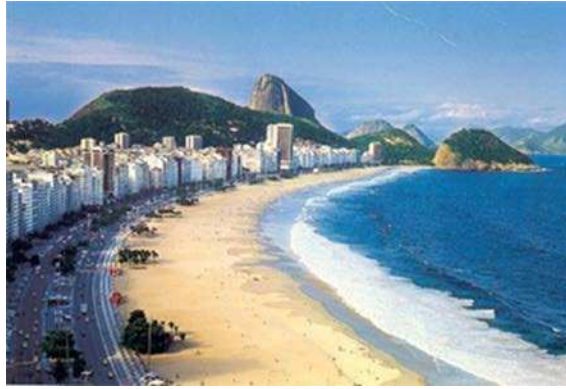
Fig. 3. Copacabana Beach Resort, Brazil [12]