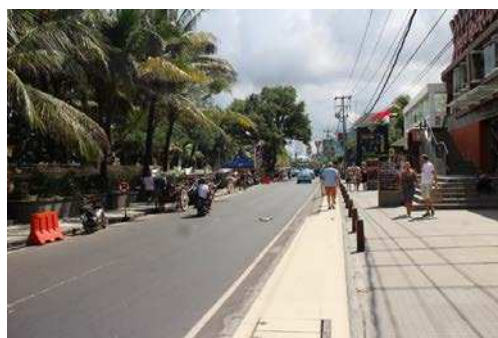
Fig. 4. Image of Jalan Pantai Kuta as a good example of the physical boundary

In relation to the use of these principles and the background challenges, it can be highlighted that the ideal boundary line which is most effective to be implemented in Bali is the combination principle. It is not difficult to find an example in the use of this combination since it can be seen at Kuta beach resort, i.e. Jalan Pantai in front of Hard Rock Hotel in Kuta. According to the chairman of Parum Samigita (Seminyak, Legian and Kuta society) this access was initiated from individuals, the local government only facilitated it so it can be said it was not the government initial programme. The length of the boundary following the shoreline is approximately 2 kilometres. Besides the street access as the boundary line, it is also completed other landscape elements: trees and wall, although the wall protection might be too high leading to the obstruction of the beach beautiful scenery (fig.4). There is real evidence at this area that the concentration of the beach users and guests with various activities has taken place in the beach section. Therefore, this approves that it gives advantages for all parties.