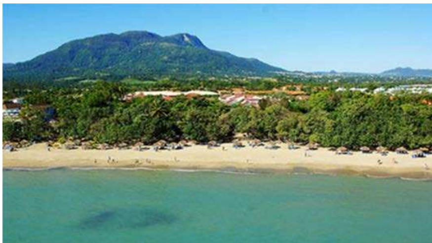
Fig. 2. Playa Dorada Resort, Puerto Plata, Puerto Rico [11]

Soft boundary. The placement of tree in a row as a boundary line between private and public space is articulated as the use of soft boundaries. This concept can be implemented fairly effectively in tropical climate zones since it can improve the outdoor thermal temperature and to prevent humid wind or vapour from the sea. The groups of tree can also be used effectively for solar protection. Whilst, light and shading because of the planting, it makes the beaches appear more natural. The use of any vehicle on the beach can be avoided so the beach becomes more tranquil and healthy. The guest and the tourist facilities' owners prefer this model as it seems not too strong (or at the same time ineffective), so there is still an opportunity to use fully public spaces. One of the tourist resorts which has adopted this model is Playa Dorada Resorts, Puerto Plata in Puerto Rico (South America) which is located in tropical climate zones. The idea of placing trees is to make greenbelt areas on beachfront soft boundaries, are able to be used as a buffer zone from sea wind flows (see fig. 2).