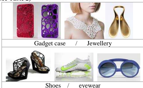
Table 2. Fashion Applications of 3D printer [4]

3D printing technology is also used in other fashion items like gadget cases, jewellery, shoes, and eyewear (see Table 2)