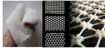
Figure 3 3D printed fabrics, [15]

The combinations of algorithms and the patterns generated by formulas can create extensive 3 dimensional forms including fractal dimension [7]. The principle of 3D printed fabric is a combination of each unit or digitalised weaving using calculations [7]. 'Pringle of Scotland', the fashion brand, and material scientist, Richard Beckett, collaborated to create a series of 3D printed fabrics using selective laser sintering (SLS) methods [15]. Scrawford created a set of flexible and flat structures using triangular, square, and hexagonal grids (see Figure 3, [15]).