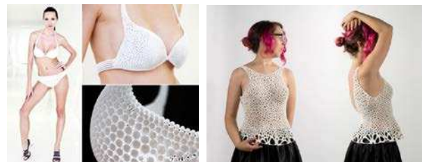
Figure 4 N12 bikini [3] and The kinematics dress [12]

Huang, who made the first 3D printed N12 bikini, mentioned that the private unit price might be higher but 3D printing technology gives more creativity and a user-friendly varied design [3]. Their bra is supportive, but also flexible, and tiny, semi-porous holes help to keep it dry and not clingy (see the left on Figure 4). Nervous System, a design studio in Massachusetts made each unit fixed but combined them as an extended 3D printed fabric [12]. Their kinematics case study started with a 3D body scan of the targeted person. Afterwards, the design of the dress was decided. It was tessellated with a triaged pattern following the dress's drape and allowing the wearer to move (see the right on Figure 4, [12]).