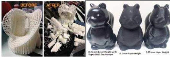
Figure 2. Finishing [2]

(supports removal and surface post treatment)