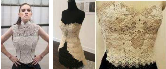
Figure 5 3D printed clothings, [17]

Catherine Wales mentioned 3D printing gives the possibility to create designs with no limitations [1]. In addition, she pointed out the convenience and accuracy of a 3D tailor-made design for a specific body shape. In the same vein, 3D printing pioneer Iris van Herpen also addressed that “3D prints finally act with the movement of the body” and “Everybody could have their body scanned and order clothes that fit perfectly” [4].