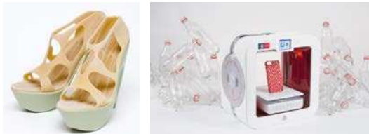
Figure 7 3D printed shoes and Ekocycle 3D printer, [7] and [5]

Avi N. Reichental, President and CEO of 3D Systems also mentioned 3D printers empower sustainable developments while producing products efficiently because 3D printers only use the required amount of materials for specifically designed parts with near zero waste. Using recycled plastic can be a good way for sustainable design. The Ekocycle 3D printer uses recycled PET plastic to print bracelets, shoes and many other objects (see the right of Figure 7, [5]).